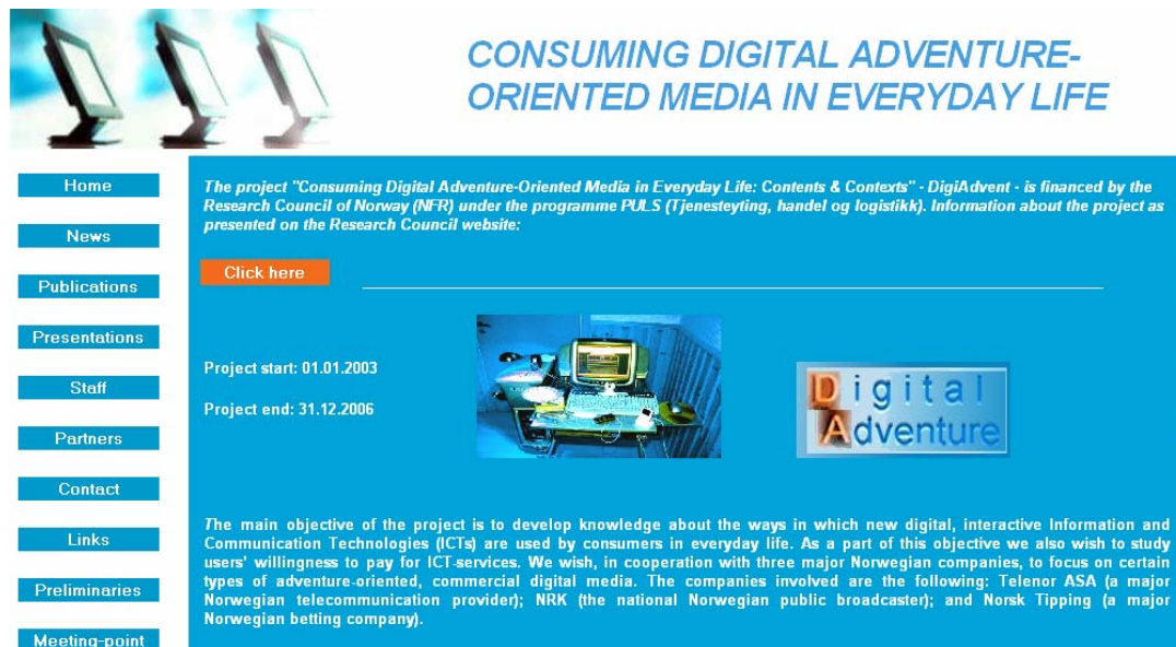
Fig. 1: Project webpage - www.sifo.no/digiadvent

(hyperlinks to related and relevant websites and documentation sources), Preliminaries (not used, but intended as a source for partners to exchange ideas on preliminary material) and Meeting-Point (for recruiting interviewees/ respondents through the web-channel).