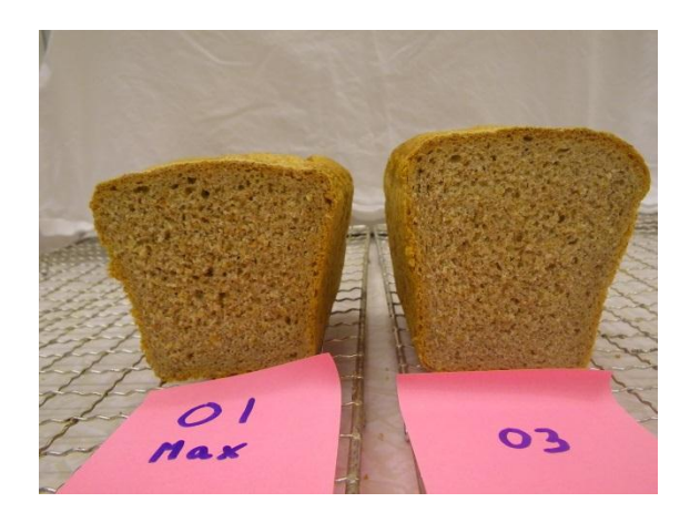
Height of bread, max capacity and normal capacity