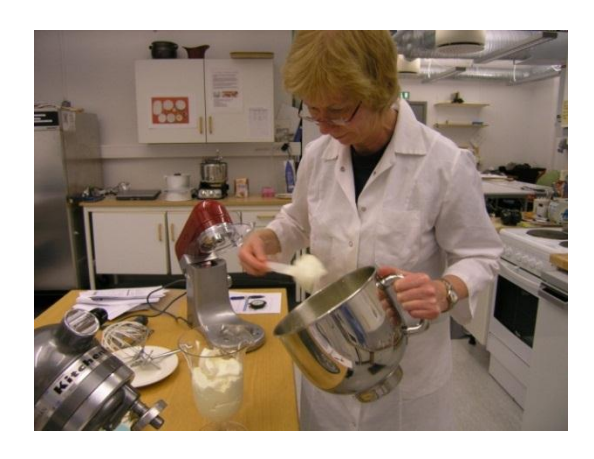
Measuring volume of cream