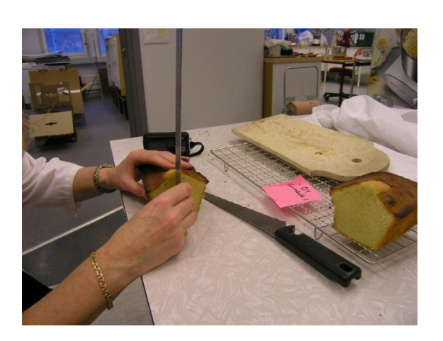
Measuring height of cut cacke