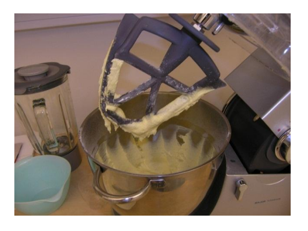
Batter, flexible beater, Kenwood Major