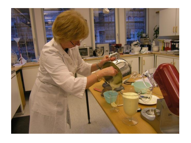
Measuring volume of eggnog