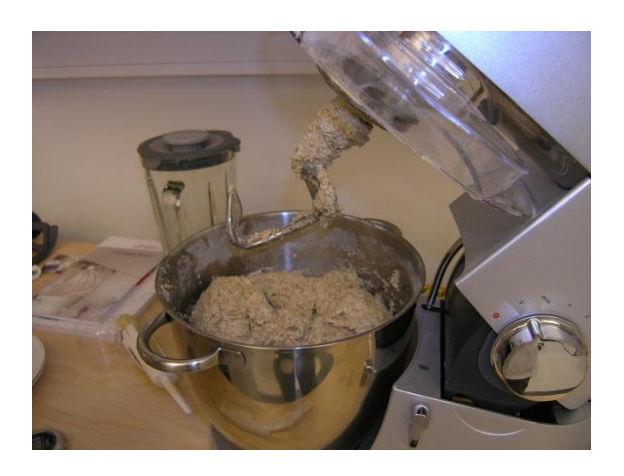
Max capacity, Kenwood Major Titanum