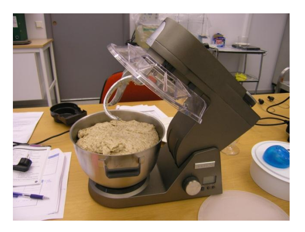
Normal capacity, Krups