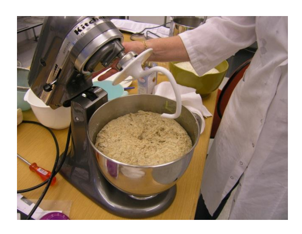
Normal capacity, KitchenAid