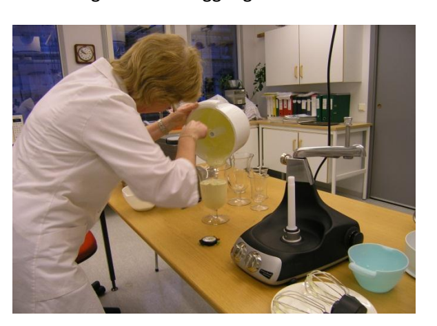
Measuring volume of eggnog