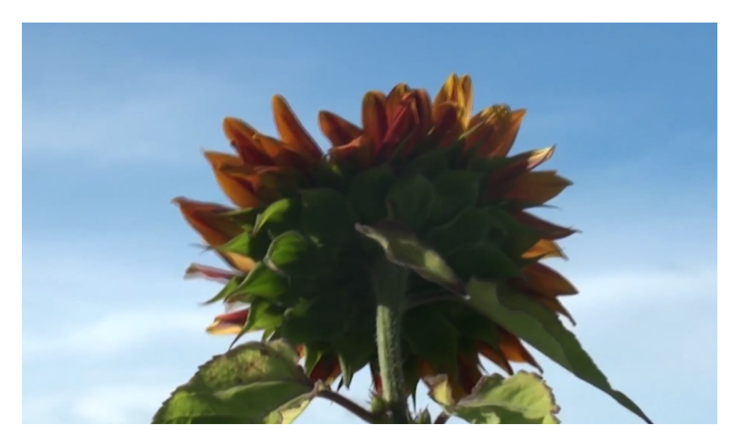
Video 2. The Kitchen Garden. https://film.oslomet.no/the-kitchen-garden