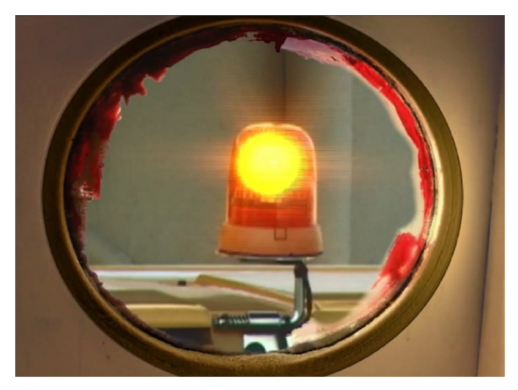
Video 1. A Ship with a View. <a href="https://film.oslomet.no/a-ship-with-a-view">https://film.oslomet.no/a-ship-with-a-view</a>