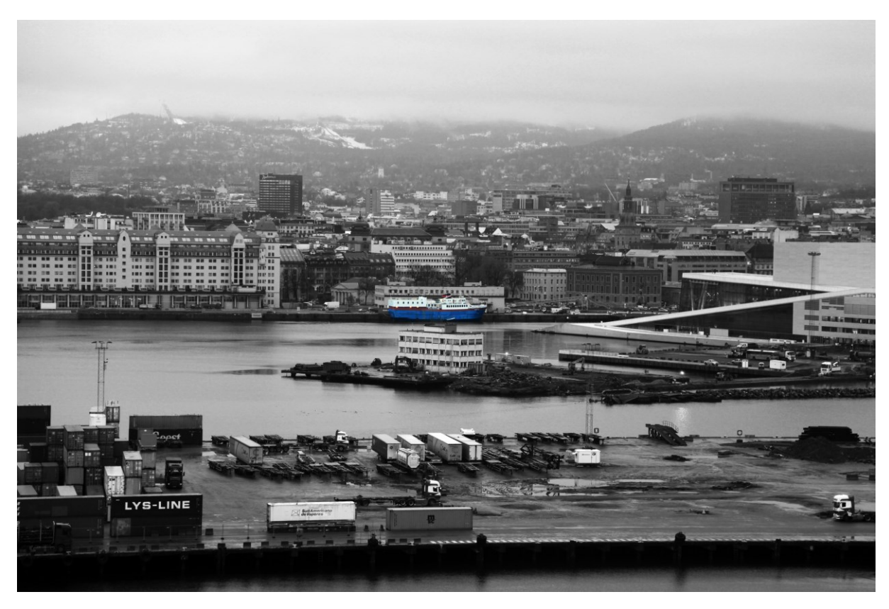
Figure 1. MS Innvik moored at Langkaia in 2010

A Ship with a View and The Kitchen Garden are continuations of this practice. However, in retrospect, these works come to mind when we ask what art education could bring to a discourse of sustainability, which I will comment on further after a presentation of the works.