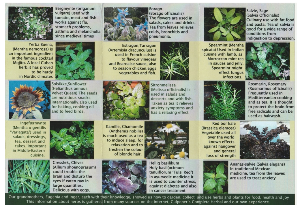
Figure 4. Information brochure on the herbs in The Kitchen Garden.