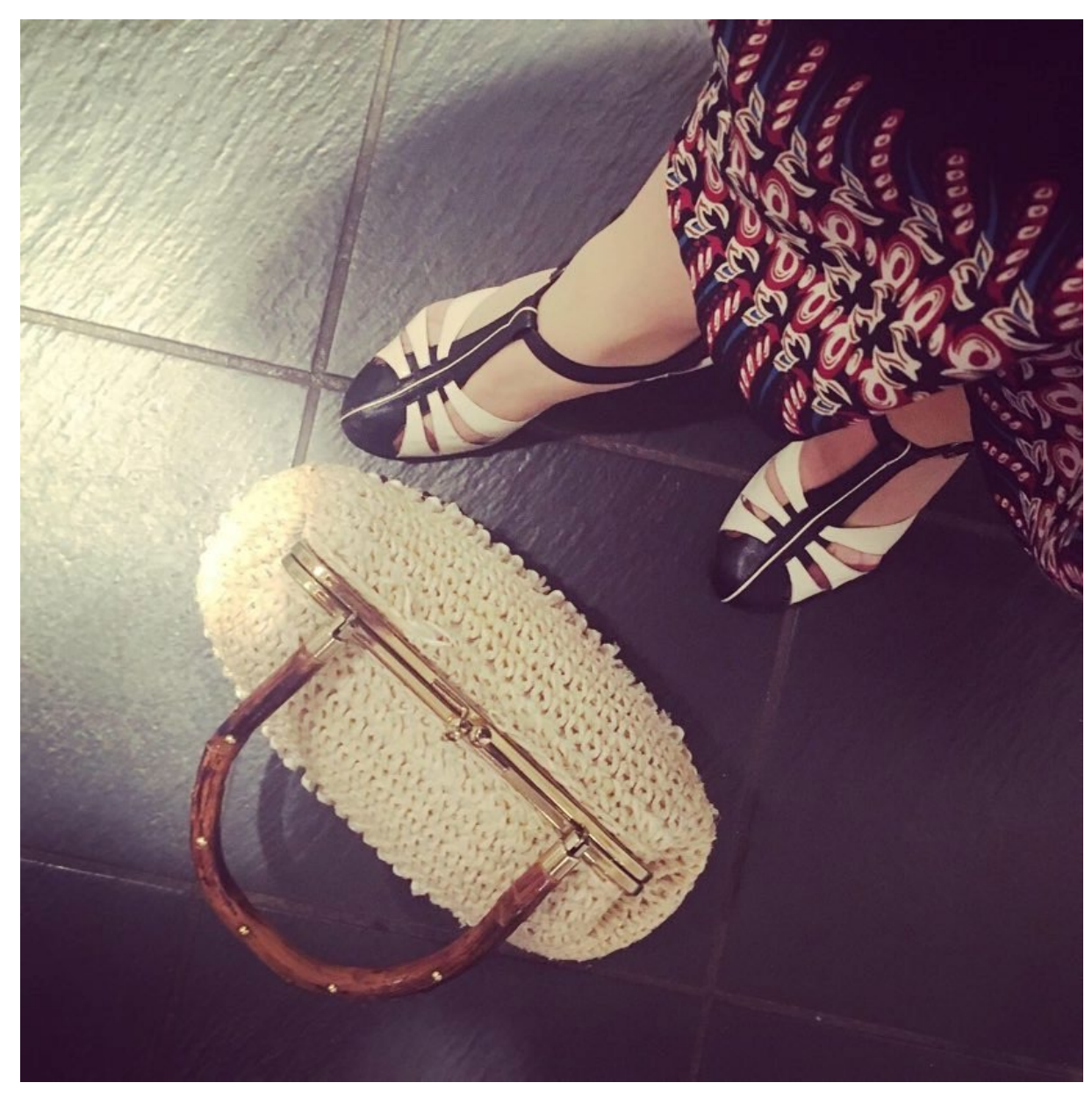
FIGURE 3.5: SHOES MATCHING THE OUTFIT, SWING DANCE (PICTURE PRESENTED BY ONE OF THE PARTICIPANTS)

"You can see it when you are looking at the shoes: if someone has shoes that are suitable for dancing, if the person is a dancer. Maybe more important for followers" (man, Argentine tango dancer, 6 years of the experience),