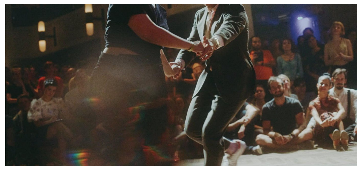
FIGURE 1.3: COUPLE DANCING LINDY HOP (PHOTO PRESENTED BY ONE OF THE INFORMANTS)

Wright (2003) also refers to swing as a fun dance, because of it styling freedom (see Figure 1.3) . The concept of freedom of the expression as well as the possibility to dance independently from you partner is a popular concept in swing dancing, which defines it from the other forms of social dance (Tucker, 2013). The development of 'breakaways' in the form of solo improvisation of each dance partner, while dancing side by side without any hand or body contact, as the defining property of swing dancing, is the elaboration of individual and community, as well as the celebration of democratic principles of jazz.