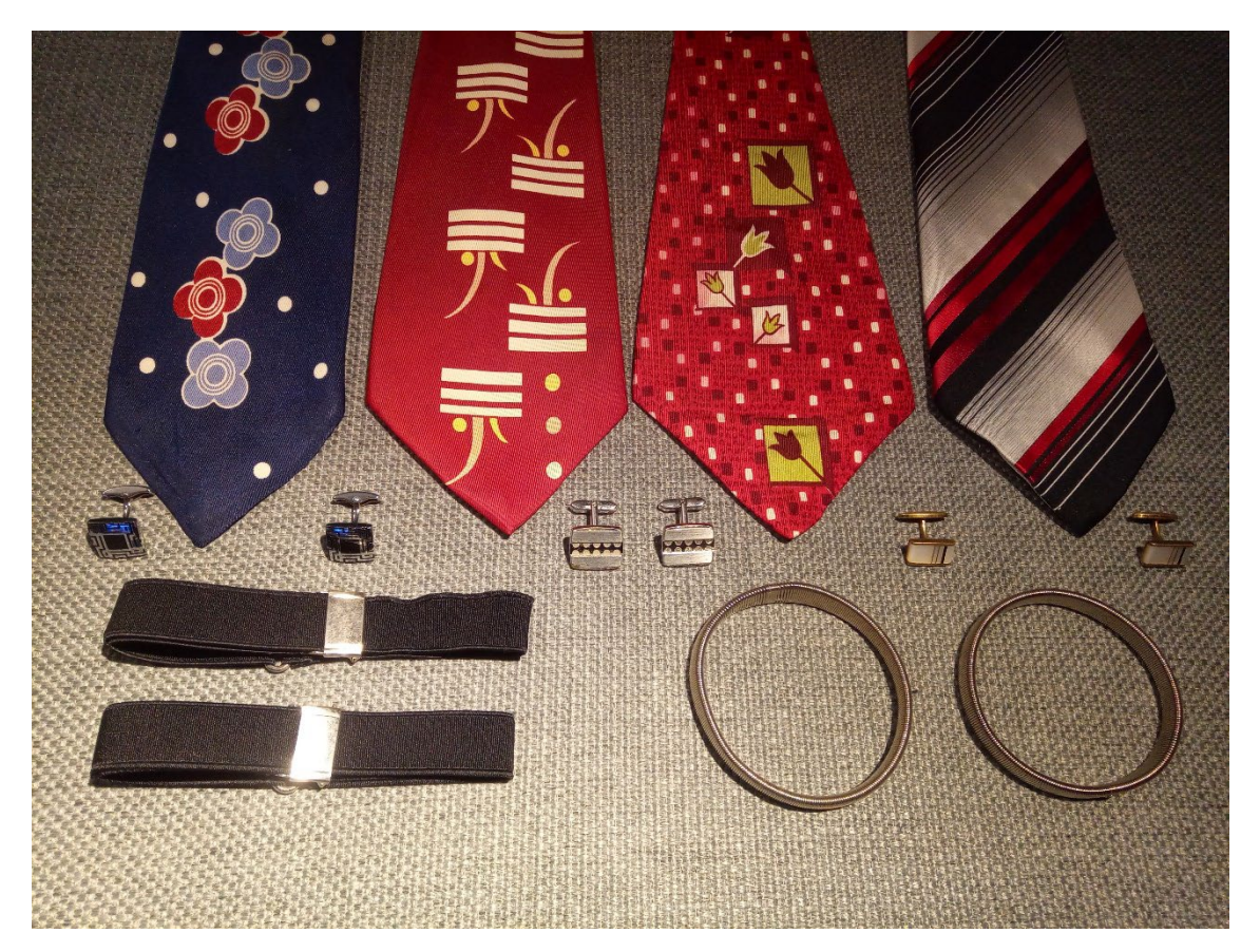
FIGURE 4: VARIATION WITH THE TIES, SWING DANCE (PHOTO PRESENTED BY ONE OF THE INTERVIEW PARTICIPANTS)

"I think it is a woman thing, the most men even not think about it. We have been conditioned to like always to wear something good, new, shiny, fancy. I think it is inbred sometimes" (woman, swing dancer, 3 years of the experience).