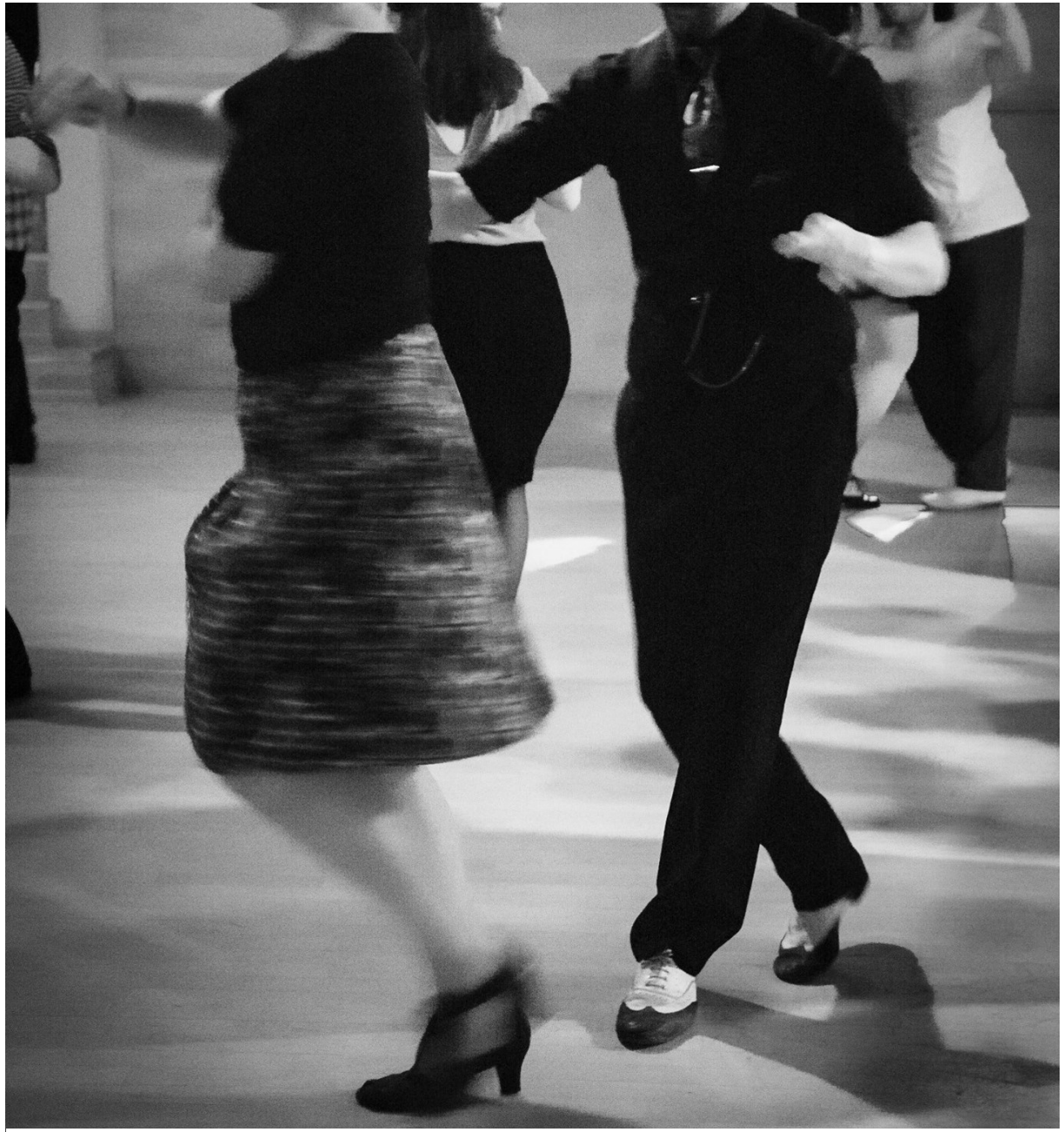
FIGURE 3.7 : 'THE BASIC FORMULA' OF MALE OUTFIT, VARIATION WITH THE VEST, SWING DANCE (PICTURE PRESENTED BY ONE OF THE INTERVIEW PARTICIPANTS)

"men's attire traditional" structure, that "comes with the experience: you know what works", gives the male dancers the possibility to avoid planning their outfit.