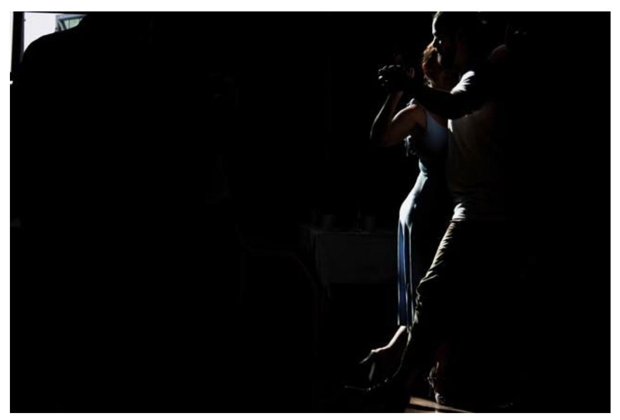
FIGURE 1.2: COUPLE DANCING ARGENTINE TANGO

Argentine tango is a couples' dance which – unlike standardized international style tango – does not follow fixed sequences of steps or figures and is only really choreographed for show or stage performances. Ideally, Argentine tango dancers improvise while dancing, i.e. combining steps arbitrarily that lead the dancers in different directions around the dance floor. A tango couple usually reflects traditional gender order: the man leads and the woman follows. (Targhetta et al., 2013)