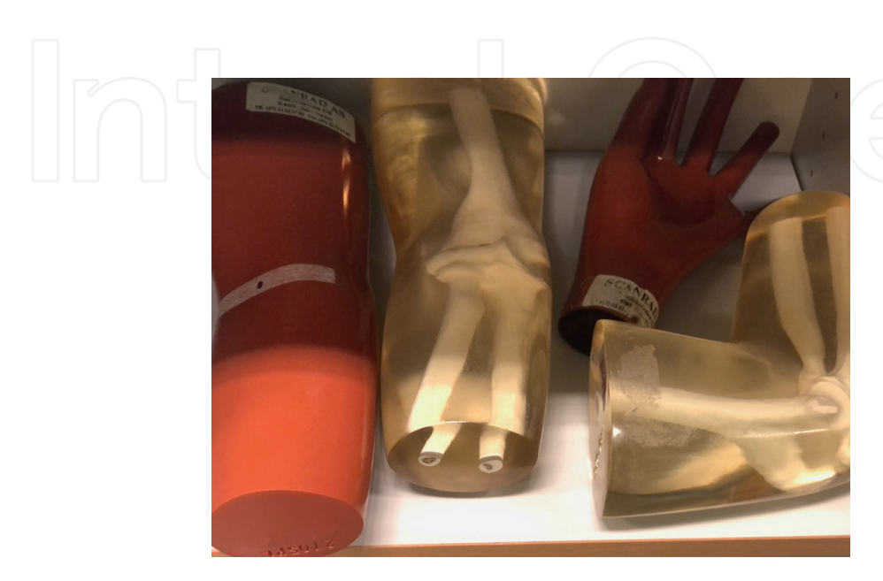
Figure 1. Phantoms, detail.