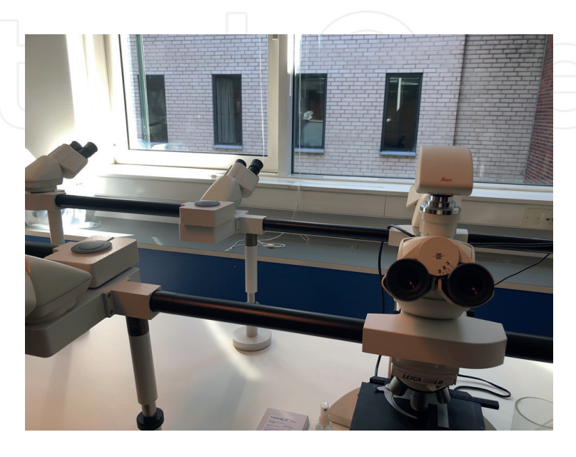
Figure 3. Discussion microscope.

Challenges in this project included the need for extensive training of the AI models to ensure accurate and reproducible results in both AI and a biological context. Furthermore, ensuring that AI models align with the standards and guidelines set in the WHO protocols. Relevant approaches for educational purposes would be integrating AI and biomedical concepts in the curriculum to expose students to the interdisciplinary nature of the field, utilizing case studies, simulations ( Figure 4 ), or collaborative projects, to provide students with hands-on experience in interdisciplinary problem-solving.