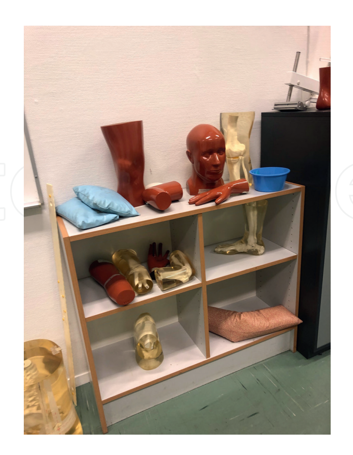
Figure 2. Phantom collection.