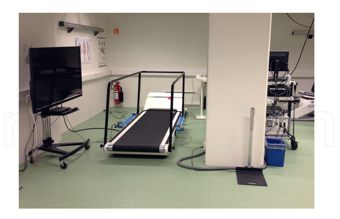
Figure 6. Motion analysis laboratory.

relevant for someone who is developing logarithms in artificial intelligence to have a clear understanding of how the logarithms should be used in relation to a patient [38]. Nevertheless, this can be an appropriate way to put people together because they learn about different scientific traditions, different criteria for research, and different basic