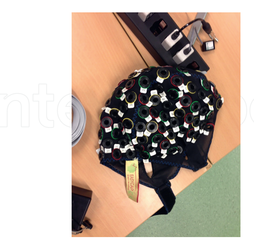
Figure 5. Cap for fNIRS.