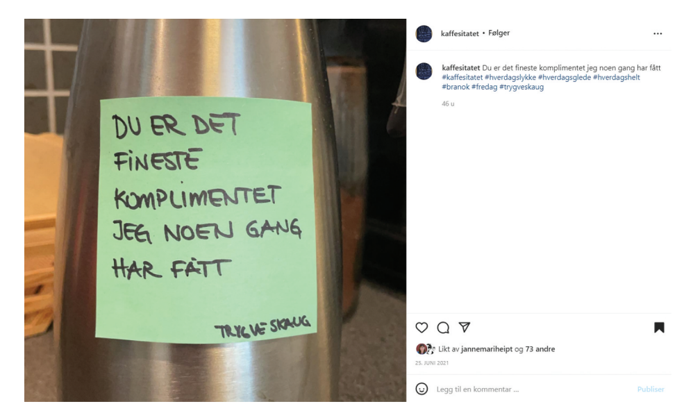
Figure 14. A post by the poetry curator profile @kaffesitatet.

skin. Other photos show tattoos inspired by poems, with more visual components added and making up the complete visual expression (Figure 15).