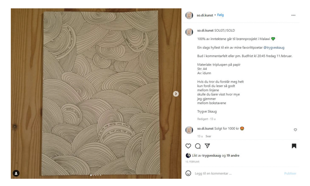
Figure 8. An illustration featuring a poem, auctioned off by the illustrator. All earnings went to an aid project in Malawi.

Using their official Instagram accounts, various artists also share either the poetry set to different types of illustrations, photos with paintings inspired by a poem, or a poem being part of their artwork (Figure 9). An illustrator behind the account @detfolktenker has illustrated a poem (Figure 10), an illustration that