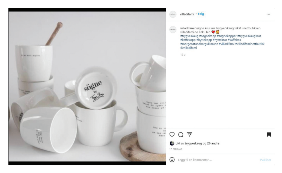
Figure 2. Mugs with poems, as presented by an online store.

The most depicted and shared poetry artefact, by both ordinary users and professional accounts, is coffee mugs with poems inscribed (Figure 2). These mugs are a collaboration with a Scandinavian interior company Sögne Home . They are sold from his official webpage and by multiple other businesses that