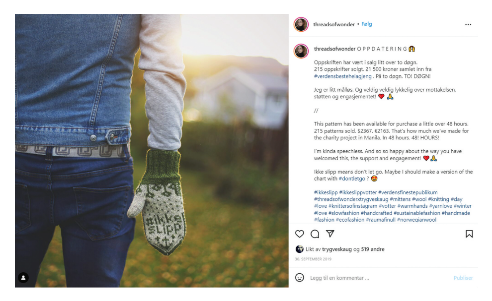
Figure 3. Mitten and knitting pattern, in collaboration with Trygve Skaug.

T-shirts and tote bags. A collection of photos shows clothing items and tote bags with selected poems. This is a collaboration with Fair & Square, a clothing production company centred on ethically made materials. Among the photos are also the company itself showing how the t-shirts are made. Posts from ordinary users show people wearing these items, wearing poetry. In this way,