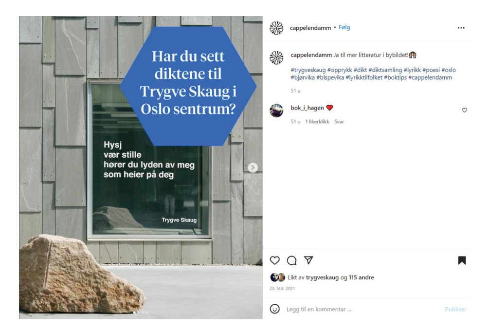
Figure 6. Photo of one of three poems found on buildings in Bispevika, Oslo.

Further posts from 2018 also show photos from his poetry exhibition Hjemmekamp , where poems were put on exhibit the same way and in the