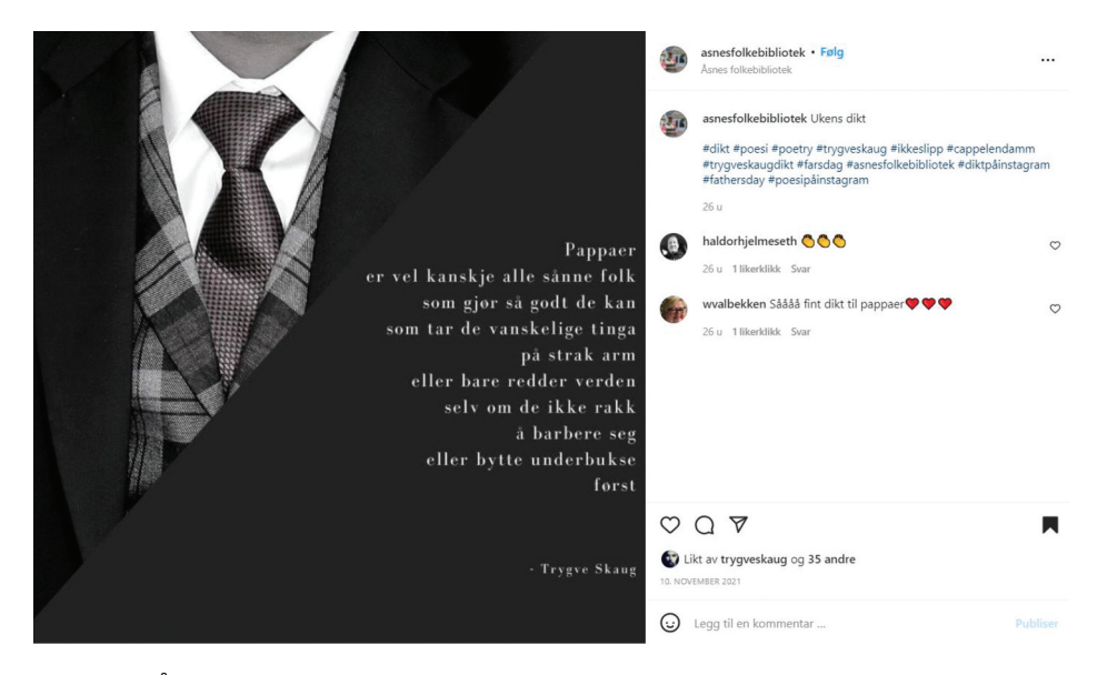
Figure 11. Åsnes Library with a visual presentation of one of Skaug's poems.

Åsnes Library in Norway, setting the words of Trygve to different images, combining textual and visual components (Figure 11).