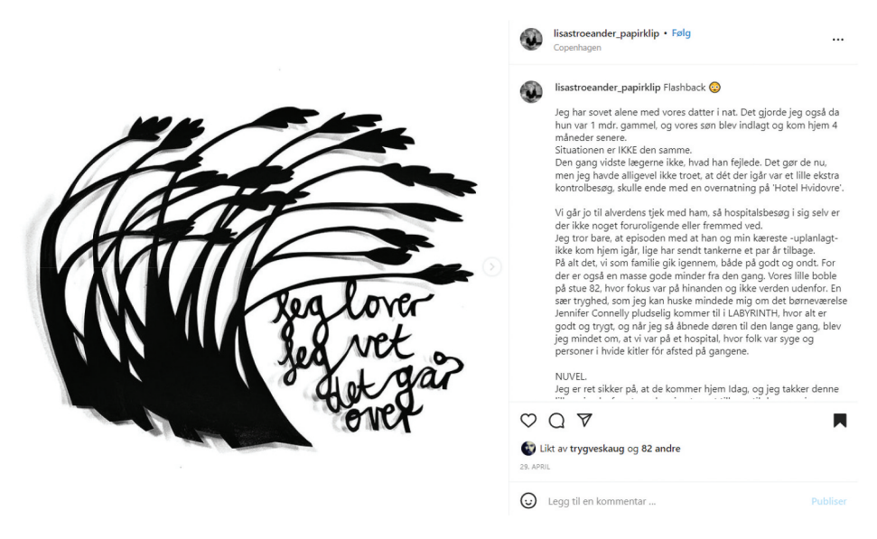
Figure 12. Paper cut piece featuring a poem by Trygve Skaug.