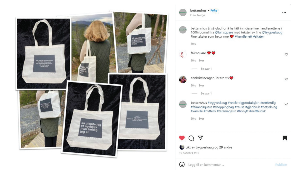
Figure 5. A store advertising the poetry tote bags.

A different collaboration concerns a specifically developed spa relaxation ritual with the Norwegian spa Son Spa , where a specific poem by Skaug is featured in