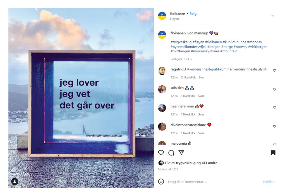
Figure 7. The so-called poetry box, found on top of a famous hill outside of Bergen, Norway.

same space art is: galleries. As with art, visitors take photos of the poems hung on the walls and post them onto Instagram, where they originally appeared as posts by Skaug.