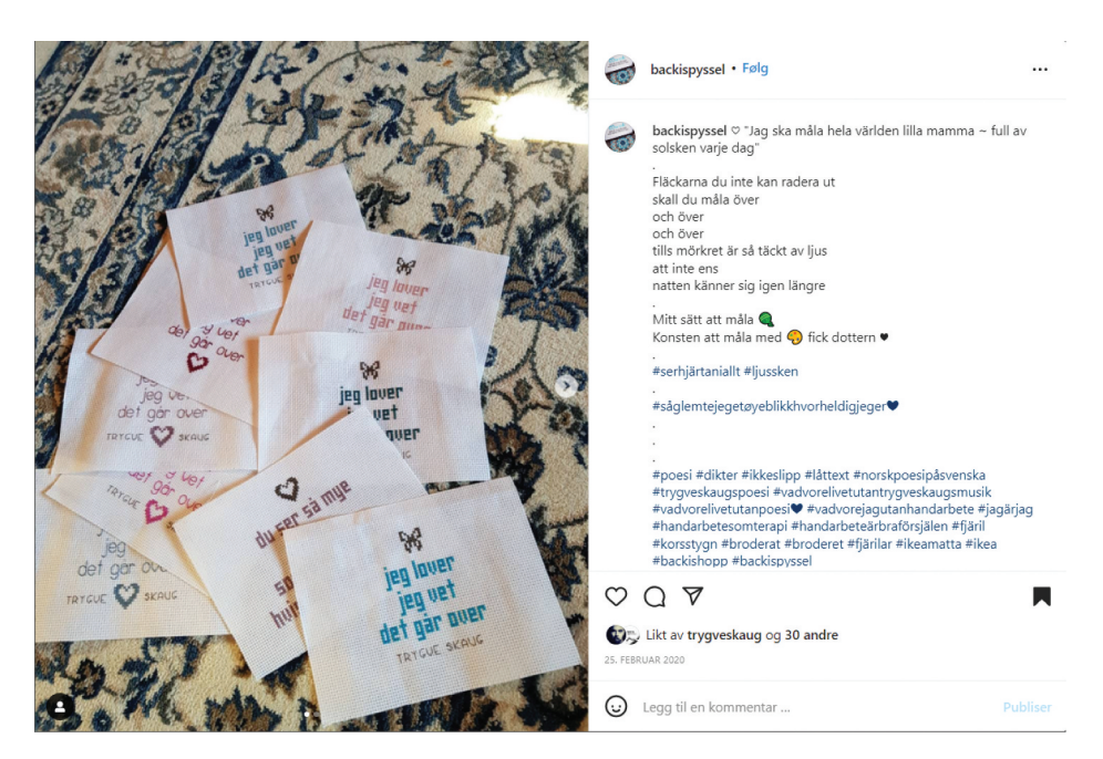
Figure 13. Cross-stitches for sale by Swedish account @backispyssel.

An example of poetry as part of every day is taken to the extreme in the collection of photos showing tattoos of different poems on the bodies of various people. Some tattoos show his poems as words "written" onto the