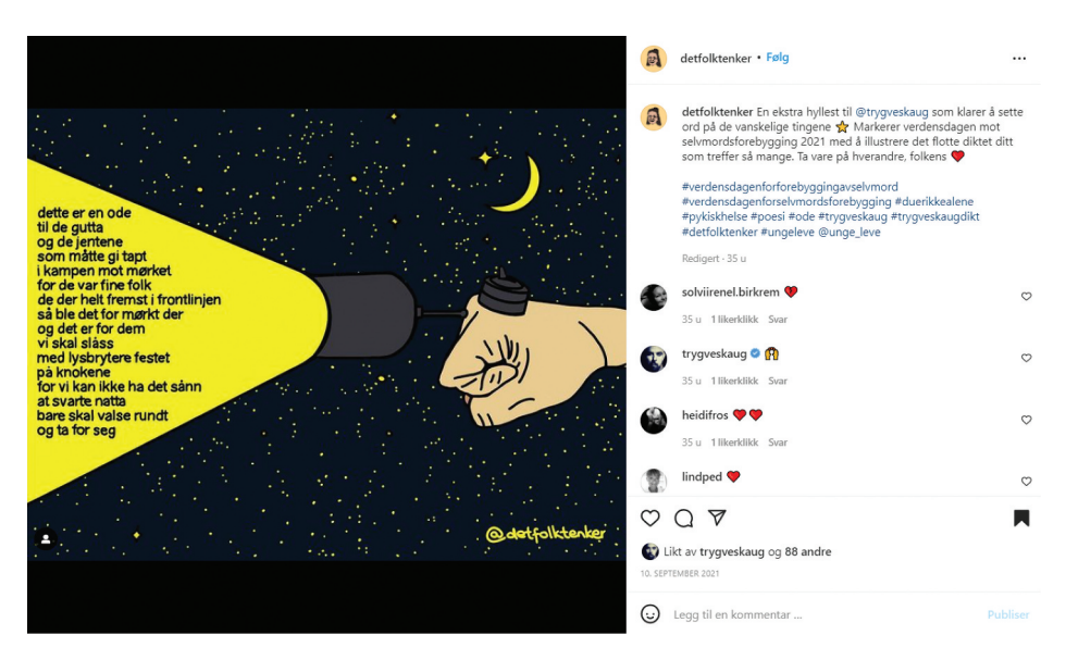
Figure 10. The text of a poem set to an illustration.

These digital creations are also found in the exhibit from accounts belonging to civic institutions such as libraries and churches. An example is the account of