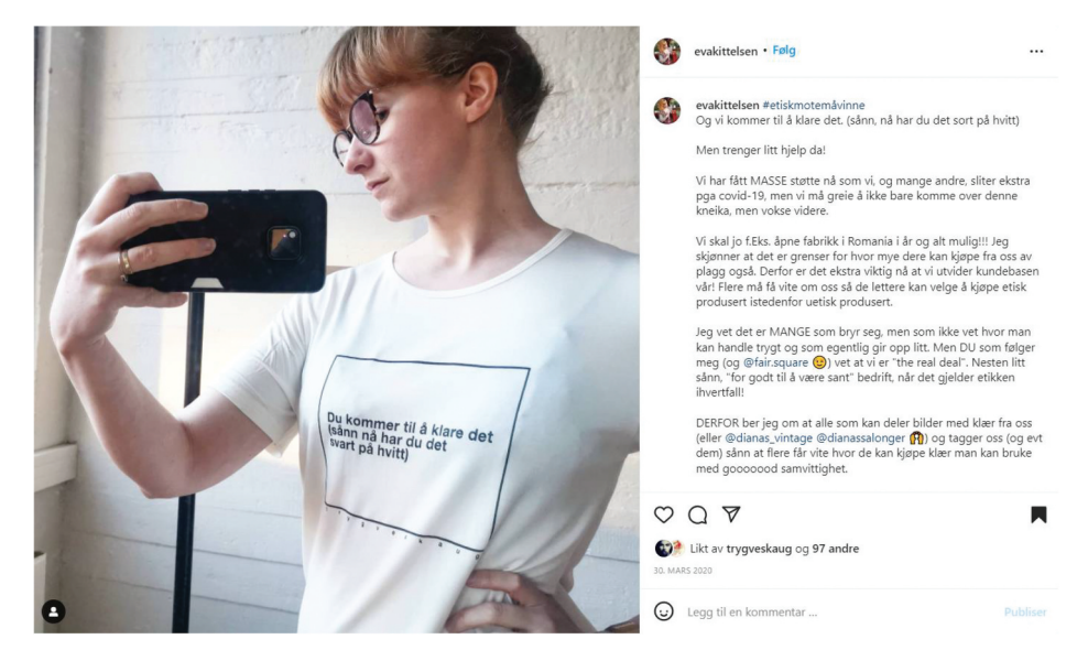
Figure 4. The official profile of one of the owners of Faire & Square, showing off one of the poetry t-shirts.

they share the poetry with the world as they go about their daily life, much the same way they post it on Instagram.