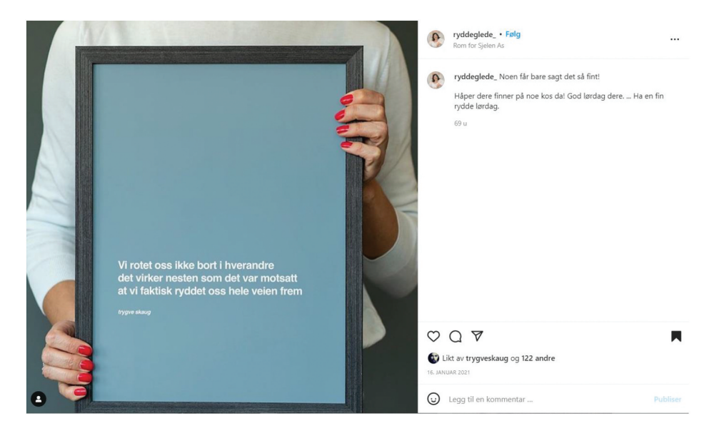
Figure 1. A post by an influencer showing one of the poetry posters.