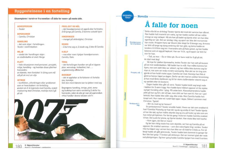
Figure 4. The elaboration peritext and the exemplary text of 5.1 (p. 180-181) in Nye Kontekst 8-10

Note. © Gyldendal Norsk Forlag. Reproduced with permission of the publisher. The transla tion and the visualization/textboxes are made by the author of the article, with permission from Gyldendal, only for this publication of the article.