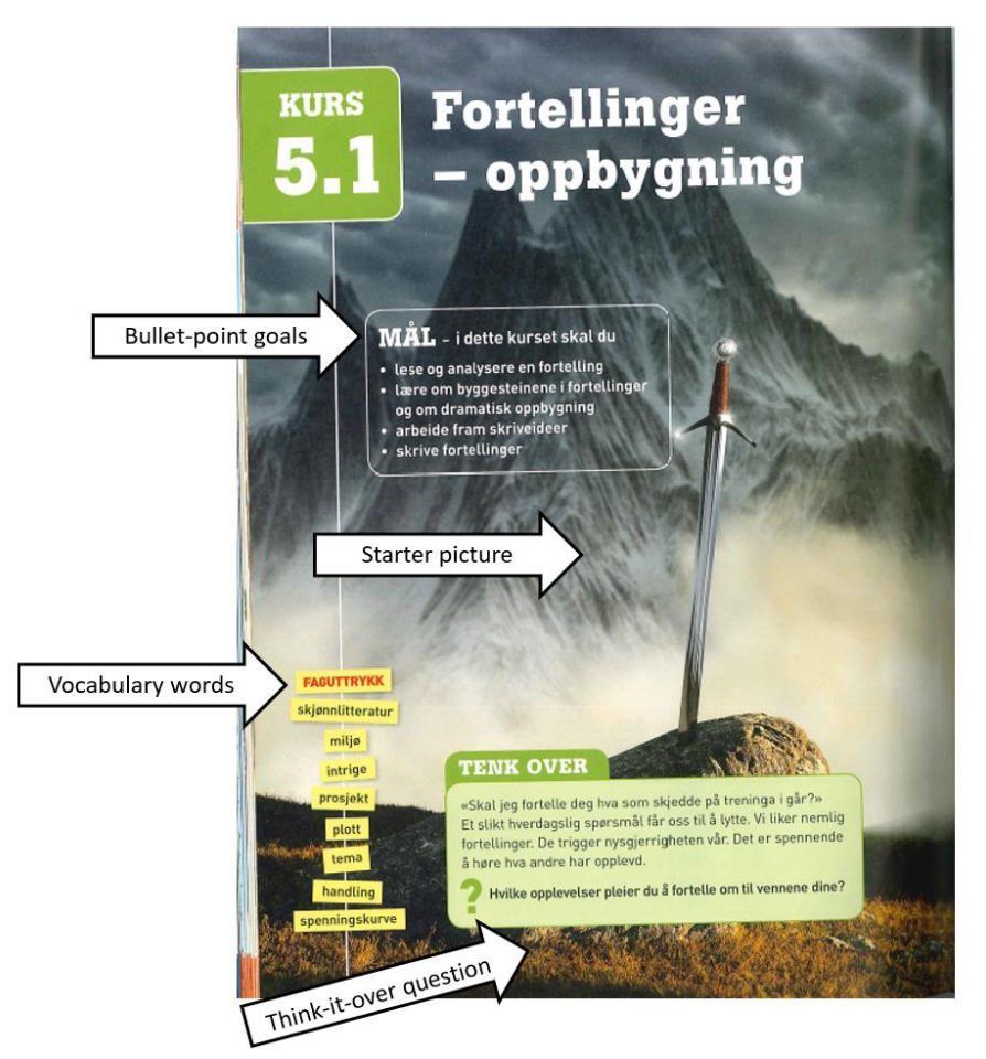
Note. © Gyldendal Norsk Forlag. Reproduced with permission of the publisher. The translation and the visualization/textboxes are made by the author of the article, with permission from Gyldendal, only for this publication of the article.

In this book, it is hard to see the running text as a privileged text element compared to the other three recurring in-chapter peritext types. Although the recurring peritexts appear to be peritextual elements, they present new information in the same way as the running text and contain important information, according to the