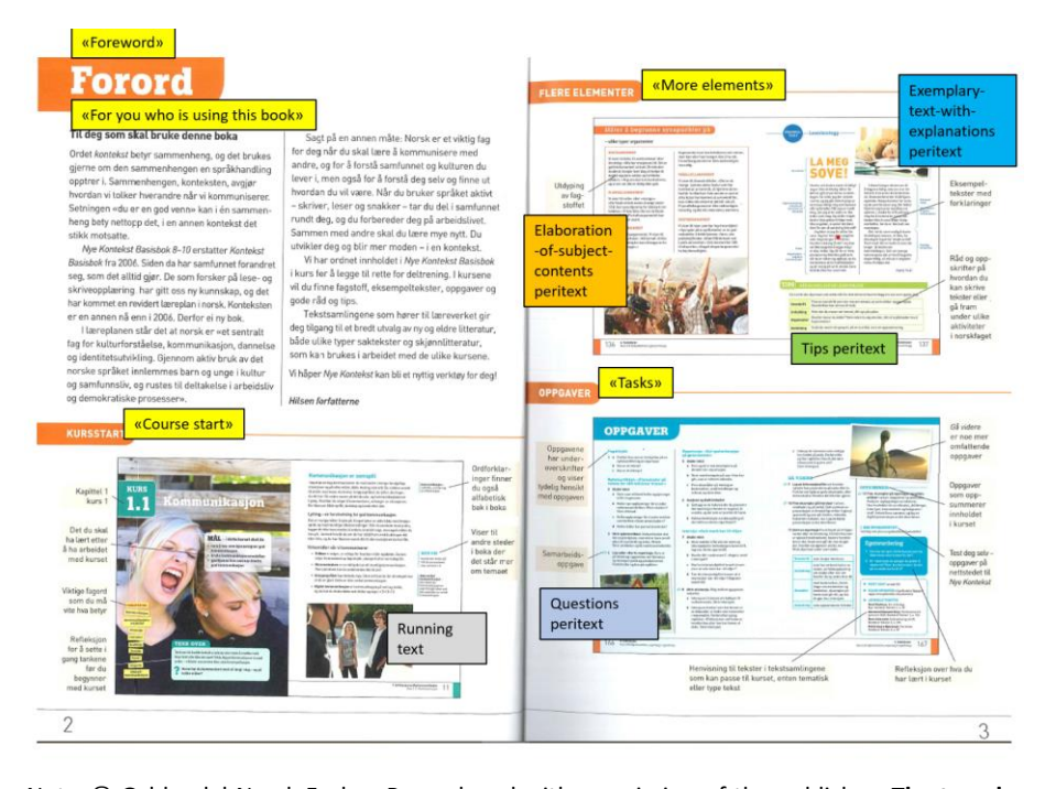
Figure 2. The reader's guide of Nye kontekst 8-10 (pp. 2-3)

Note. © Gyldendal Norsk Forlag. Reproduced with permission of the publisher. The transla tion and the visualization/textboxes are made by the author of the article, with permission from Gyldendal, only for this publication of the article.