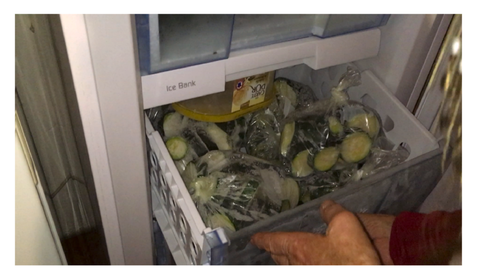
Fig. 1. The courgette fridge.

was produced by them, we consider it as a very high-quality product and try to prepare something special' (HU4). This, in turn, highlights an interesting juxtaposition between 'labelled' and 'non-labelled' food, whereby participants considered local, non-labelled products as of higher quality and more trustworthy, and revealed a greater level of material and affective engagement with them. In the words of one participant: