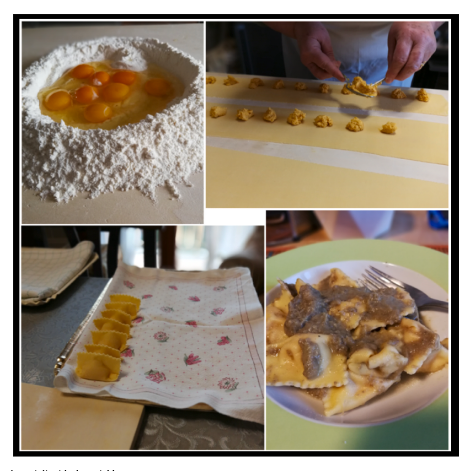
Fig. 3. Preparing homemade ravioli with the neighbour.

we noticed that these basic food products accounted for the majority of FQS purchased by participants. Importantly, when asked about the reasons behind the purchase of these specific FQS products, participants revealed that the labels were not the reason why the products were bought. Participants were almost never aware of the presence (or the meaning) of the PDO/PGI logos on their staple foods; in other words, participants bought products they knew and liked for their characteristics, or for their attachment to that ingredient, and not because of the logo, a similar finding to that reported by Eden et al. (2008). A German participant explained that he did not pay attention to the quality label, or "subconsciously maybe, but not in a way that I would have reacted to it [PDO label]'"(GE1).