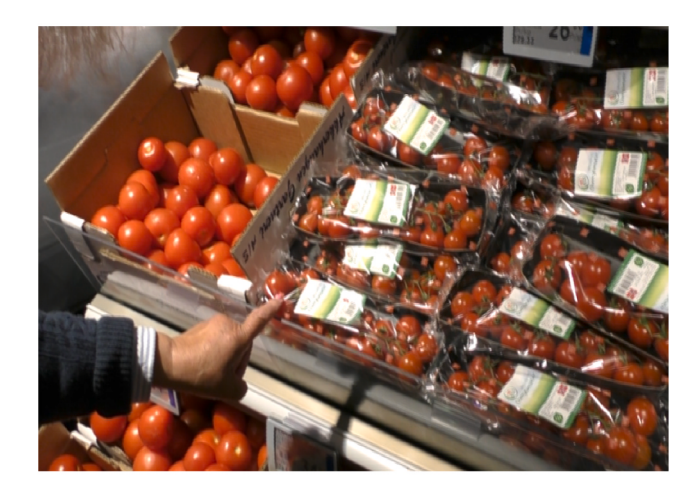
Fig. 2. An example of purchasing practices.

of routinised behaviour characterized Claire, a British mother (UK4) who rmoved to the countryside with her family and started to buy groceries online, as she found it more convenient than reaching distant grocery stores. Our participants became more reflexive of food practices following these major life changes and identified online shopping as a constraint to paying any attention to quality labels, compared to a physical store situation where consumers can pick up a product and check carefully its packaging. The major changes in their lives (e.g. changing jobs and/or residences) generated changes in their ordinary food consumption, which they reflexively identified as lacking the opportunity to engage with FQS labels.