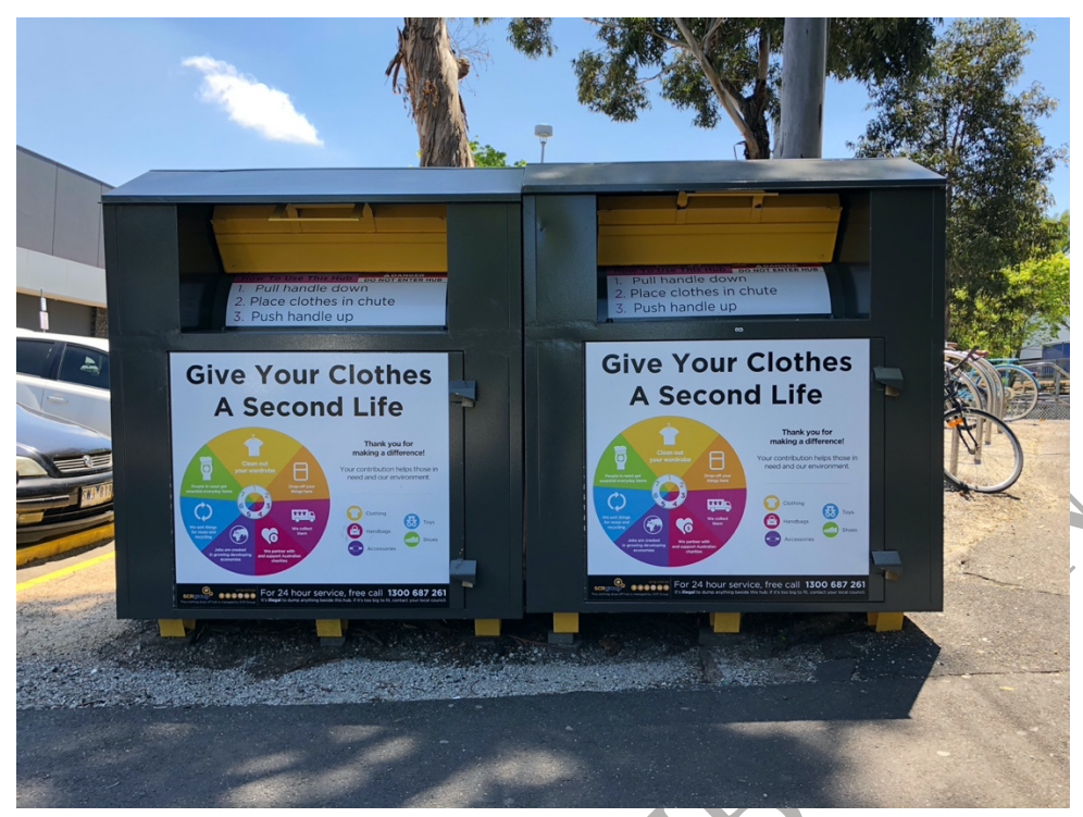
Fig. 3 Clothing donation bin at a suburban supermarket in Melbourne