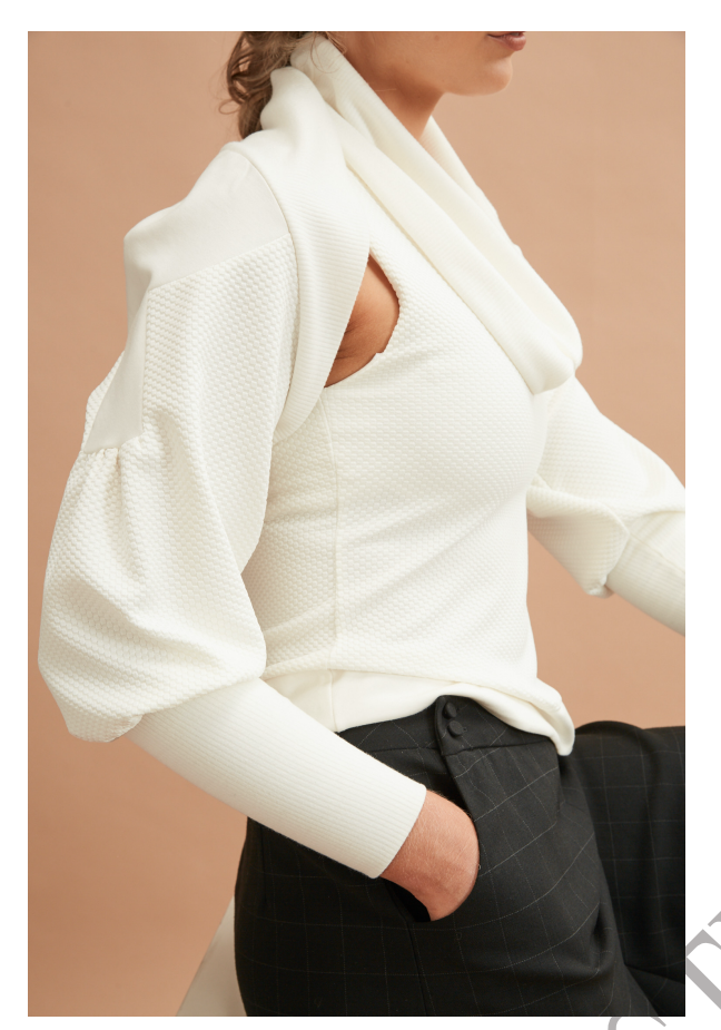
Fig. 2 Outfit from the Living Wardrobe: modular top and adjustable culottes