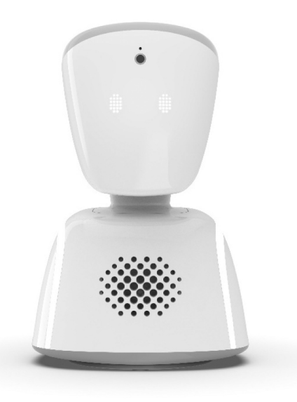
Figure 1. AV1.

In Norway, where the present study was carried out, there are two main ways of acquiring AV1. The first is a centralised model, where the school (or its municipal owners) acquires a pool of robots that they distribute to those in need. At the time of writing, this model is used sparingly. More common is a decentralised model where it is the homebound child's parents/guardians<sup>2</sup> who (1) acquire the robot and (2) try to convince their child's school to use it. In the latter model, the guardians can either buy or lease the robot with their own money or apply to a charity to borrow one for free. Given the cost of the robot (approx. £2000), the charity option is preferred by most, and it is this group of users that we focus on in this article.