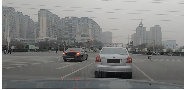
Fig. 3. One example of traffic status in a studied scenario from a metropolitan area.

coverage and generalizability, eight different scenarios were defined, comprising both straight streets and intersection movements. In total, 24 trajectories were considered. As Fig. 3 shows, there are many tall buildings surround the studied area, which may interfere with GPS signal accuracy and cause GPS information inaccuracies, which is a regular occurrence in a metropolitan environment.