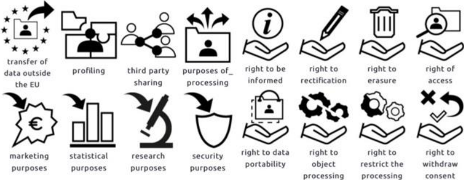
Figure 1. Rossi A. and Palmirani M. DaPIS icon set

documents which normally would take around 30 minutes to read in full [5]. These findings brought to light the information overload created by terms of service, disincentivising the users, who perceived the contracts as a nuisance, preventing them from using the services they were interested in. To address the issues users must face during this process, European regulators considered including a section regarding the use of icons in the GDPR as a means for helping users understand the meaning of those documents, but this idea was discarded in the final version of the regulation. The discussion regarding pictograms and iconography in terms and conditions has created polarised positions. On the one hand, it is argued that the use of such devices may impede understanding of the documents because the nuances of the legal language may be lost [6]. On the other hand, it is argued that the icons are intended merely to complement and clarify the legal language, not replace it [7]. Multiple sets of icons have been developed to answer this need, such as DaPIS, machine-readable icons based on the GDPR [8] and the Mozilla privacy icons, made to give users a guarantee about what companies will do with their data [9].