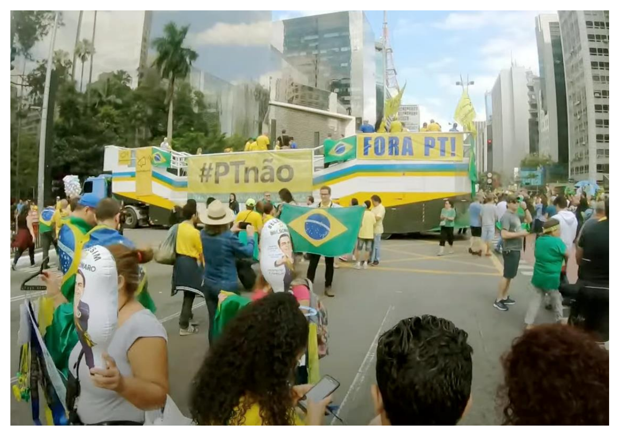
Example 7: Massive sound cars broadcasting jingles for Bolsonaro on Avenida Paulista, October 2018.

Other forms of music also played a vital role. A number of street musicians performed their own pro-Bolsonaro songs and invited participants to sing along to well-known football chants and popular songs with new words. Often, these melodies were accompanied by samba rhythms and funky carioca grooves, among others. And there were Bolsonaro jingles broadcast through massive loudspeakers adorned with Brazilian flags and banners that were placed on top of trailers: