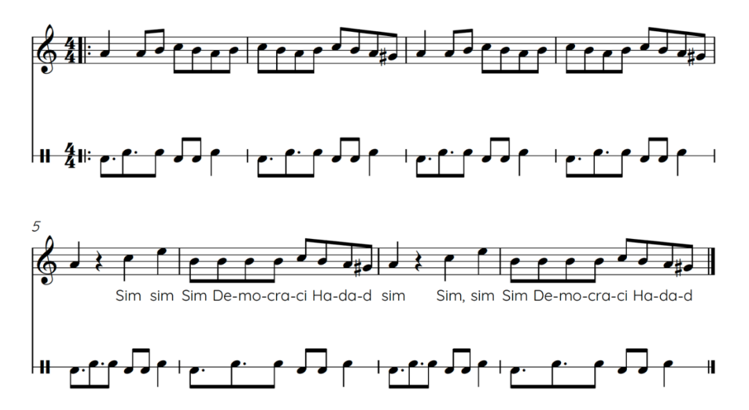
Example 4: Transcription of the musical structures that mobilized people politically at Avenida Paulista. The first line shows the melody, while the second line shows the accompanying funky carioca rhythm. Bar 1-5 was played by the saxophone, and had a hypnotic character, while bar 5-8 was sung by the protesters. The melody is based on the refrain from "Din Din Din", by Ludmilla Feat. MC Pupio and MC Doguinha, which topped the charts in Brazil in 2018.

Janeiro, where funk carioca was the most popular dance music at the time. The saxophone melody was short and lasted only four bars (around 5-6 seconds), then it was answered by call and response singing from the crowd. Thanks to the flyers (see example 3) and the saxophone's repetition of the melody, it was easy to sing along with the refrain: "Yes, yes, yes to democracy, and yes to Haddad" [Sim, sim sim, democracia, Haddad, sim]. These musical structures did important social and political work by giving voice to the demonstrators and part of their sonic organizations can be illustrated in the following music transcription: