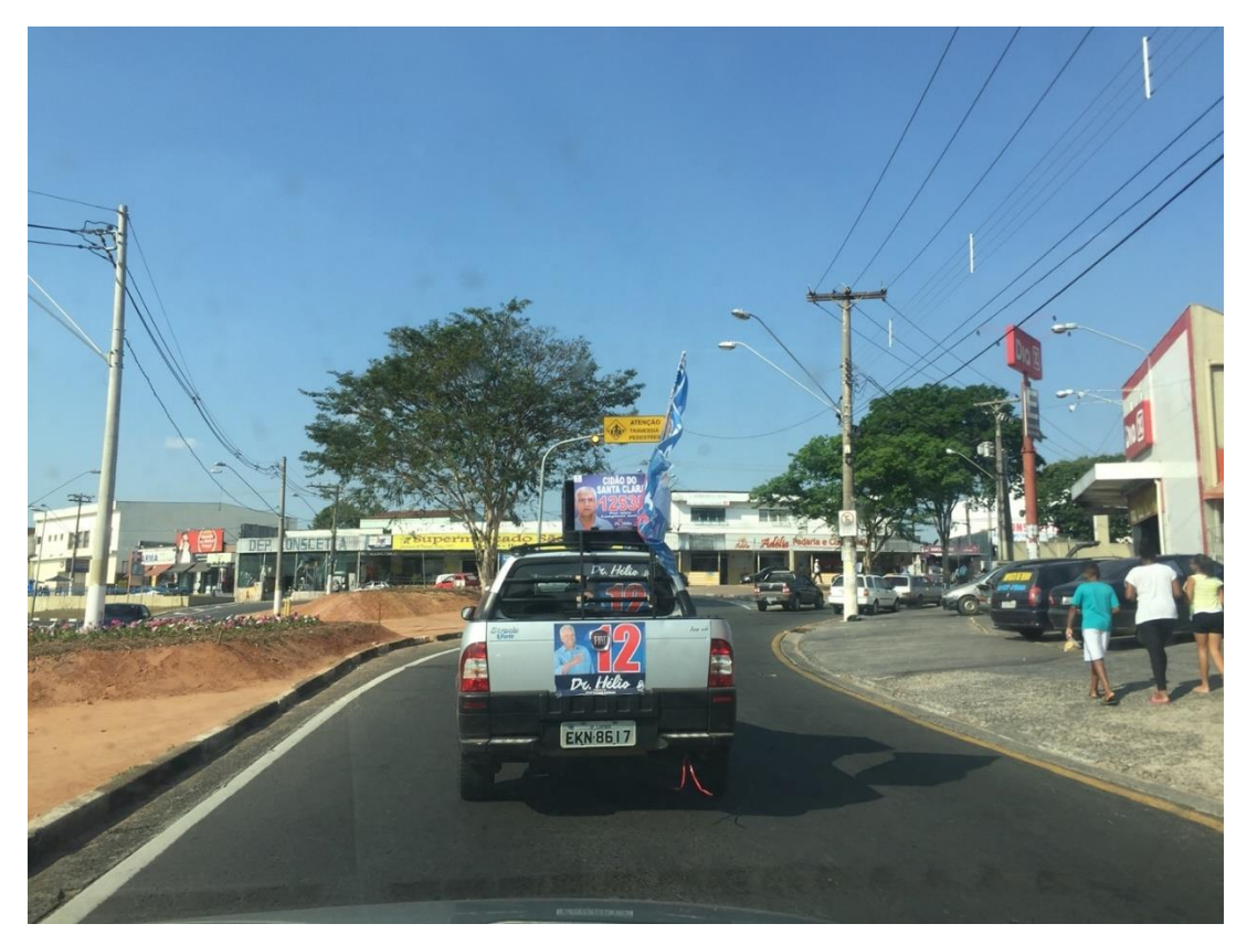
Example 5: Picture of a 'sound car' in Campo Grande)

After the new law, we cannot play the music on YouTube or the radio anymore, because each party can only have a certain amount of time on the official media channels. But we can drive around with our sound car in the neighborhood during the forty-three days of the final round of the election from 8 AM to 5 PM each day, and that is what we do. We drive our routes, playing the same jingle, which last around fifty seconds, every day from 8 to 5. That is my work. (Interview carried out in Campo Grande, Campinas, September 2016,)