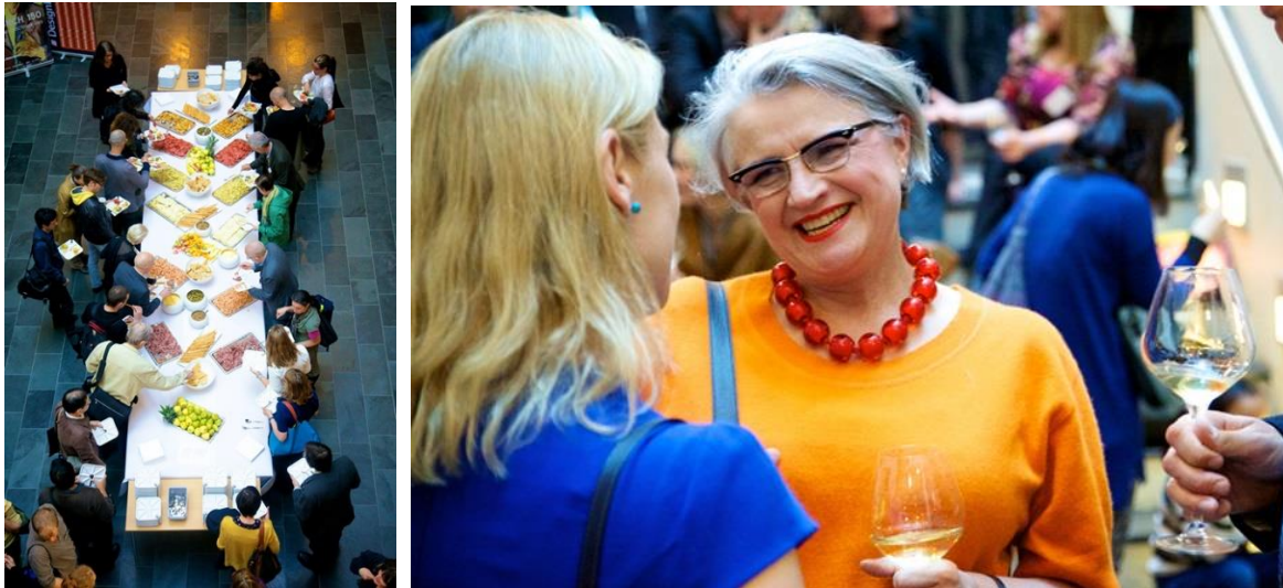
Figure 2. Meeting colleagues.