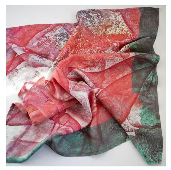
Figure 7: Motif (figure 4) printed on silk

The finished textiles woke an interest in me as a designer. New ideas came while observing the patterns.