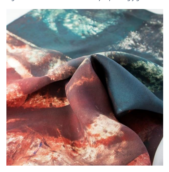
Figure 14: Finished textile print from figure 10)