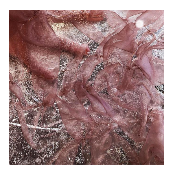
Figure 3: Picture of frozen tulle

The aim was to create new tactile surfaces and the abstract patterns only nature can create. The intendent focus was to see nature's own aesthetic and expression.