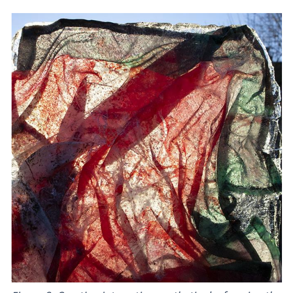
Figure 9. Creating interesting aesthetics by freezing the textile from figure 7

I went outside again but froze the printed textile (Figure 5) letting the process guide me. This created a new tactility and interesting refractions.