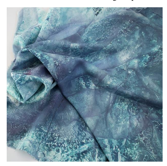
Figure 8: Motif (figure 5) printed on silk