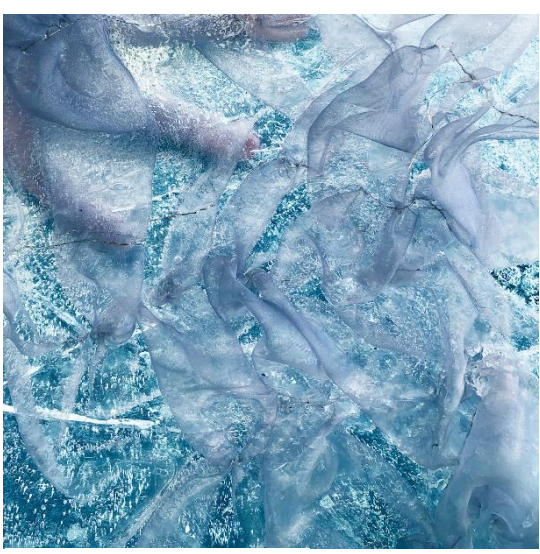
Figure 5: Picture from figure 3