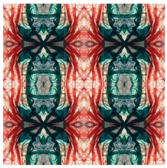
Figure 12: Patten created in PS by repeating figure 10