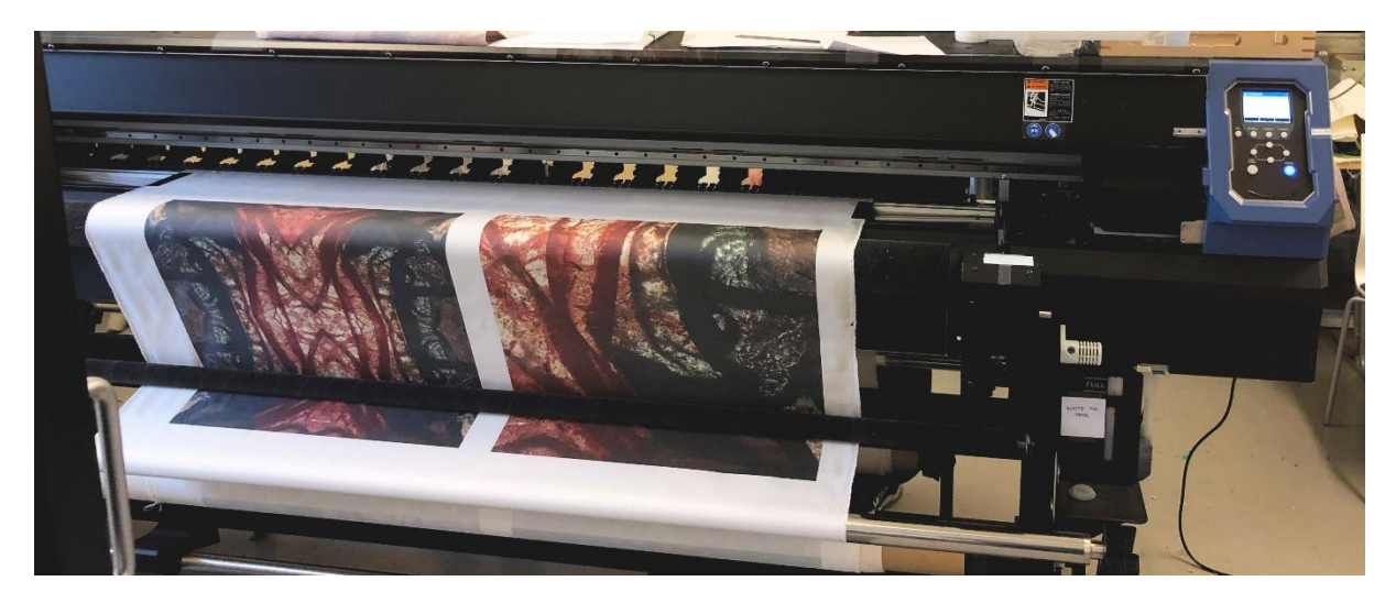
Figure 6: Mimaki in action

I printed the designs I created in Adobe Photoshop by using the MIMAKI Textile printer we have in our workshop. The material I used was 100% silk. They are durable and more sustainable [6].