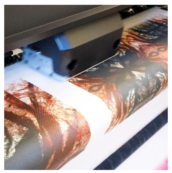
Figure 13: Mimaki Tx300P-1800 printer in action