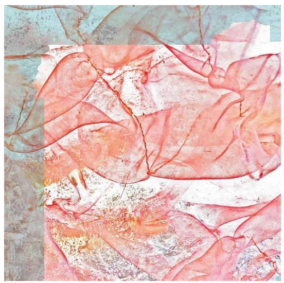
Figure 4: Picture from figure 2

Nature has its own way of creating things and it is difficult to create expressions like this by hand. I manipulated the colours in Photoshop, exploring what moods I could create by changing the colours. Through history different colours has triggered different moods in us humans [3]. This process may take up to 1-hour pr motif. I created 5 different motifs before landing on Figure 4 and 5. They capture the aesthetic and mood well. The reason I decided to not print all 5 was because of waste.