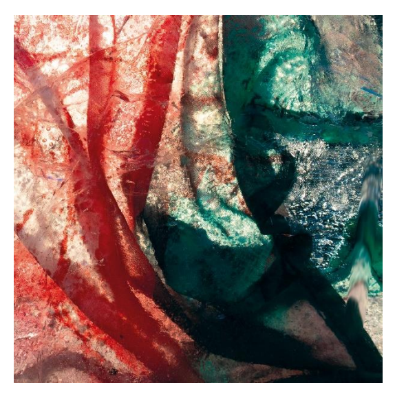
Figure 10: Close up