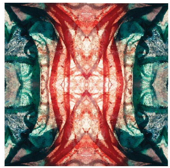
Figure 11: Patten created in PS by repeating figure 10