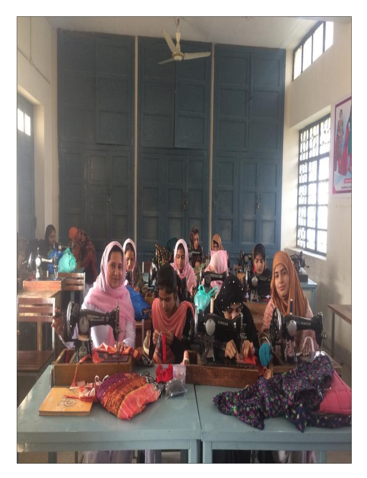
Institute 1, Domestic-tailoring course with outmoded and rustic sewing-machines