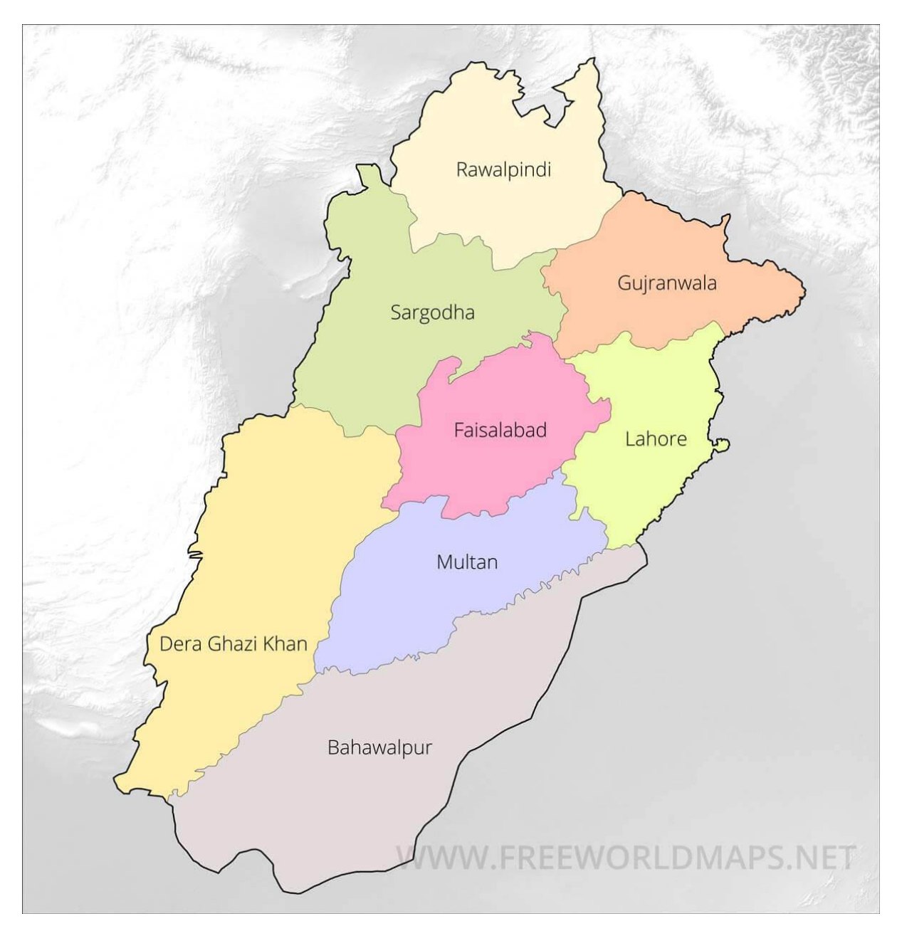
Figure 1 ("Map of South Punjab, Pakistan,")