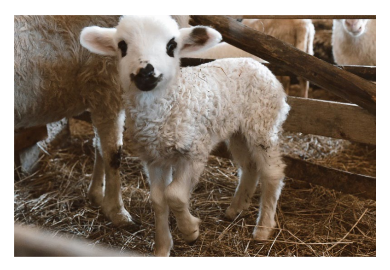
Figure 1-1: a lamb of the Polish Mountain Sheep

In a survey with sheep farmers from the KRUS project, it was also found that wool from the oldest Norwegian breed, "Villsau" (Old Norse Sheep), is not being utilized well enough, but some is instead being discarded by farmers. A conclusion from the project was that increasing the demand for wool from the older sheep breeds is the best way to increase financial returns and thereby the economic incentive for taking care of otherwise wasted wool. A way of doing this is to increase the number of wool products focusing on the variation and good qualities of wool (Klepp et al., 2019). We take this notion as a backdrop for WOOLUME, as we focus on the positives of using wool as a material for products used for cultivation, soil improvement, insulation, personal hygiene and other new and alternative wool products.