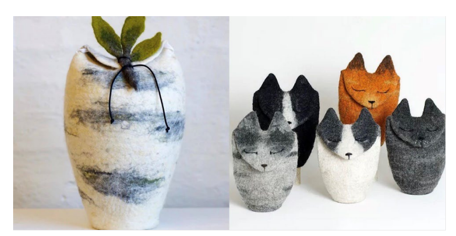
Figure 3-5: the "Birk" urn and a selection of urns for pets from Uurna made of felted sheep wool

coffins, Uurna also emphasizes the warmth and comfort that the wool urns provide to the bereaved families. They described wool felting as a sensory craft where physical energy and warmth is applied which can be sensed by the relatives. In addition, the company offers to adjust the look of the urn to fit the wishes of the families. Though the customer may fall in love with a photo of an urn from the webpage or have a specific look in mind, their urn will not look the same as products made of sheep wool will hold variations. Uurna claims, however, that time is working to their advantage as people today tend to prefer something different, a handmade unique product.