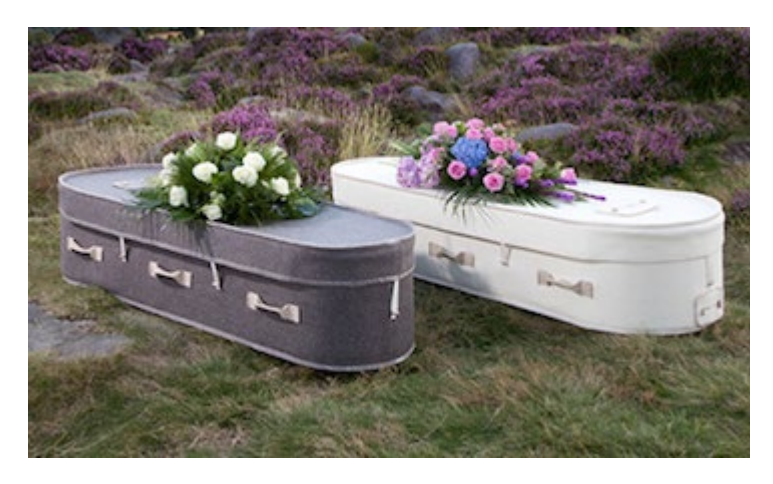
Figure 3-4: two Natural Legacy wool coffins made by AW Hainsworth

The British company AW Hainsworth<sup>24</sup> has produced a line of coffins called Natural Legacy made of new pure wool, a cardboard liner, and an organic cotton interior. The company brings forward the natural ability of being biodegradable as an advantage of using wool coffins for cremations and all types of burials. In addition, they say that wool makes for a gentler, more tactile product that is not as cold, hard, and final as a normal coffin. According to the company, this allows for a closer relationship for the family with the deceased for as long as possible. Using wool creates a comforting product that allows for greater reflection of the personality of the deceased. The low weight of a wool coffin was also brought forward as a positive, especially for parents of a deceased child carrying the coffin to the grave. A distributor of the Natural Legacy coffins, Natural Endings Funeral Services, say that customers chose them due to their softer, cosier and warmer aesthetics.