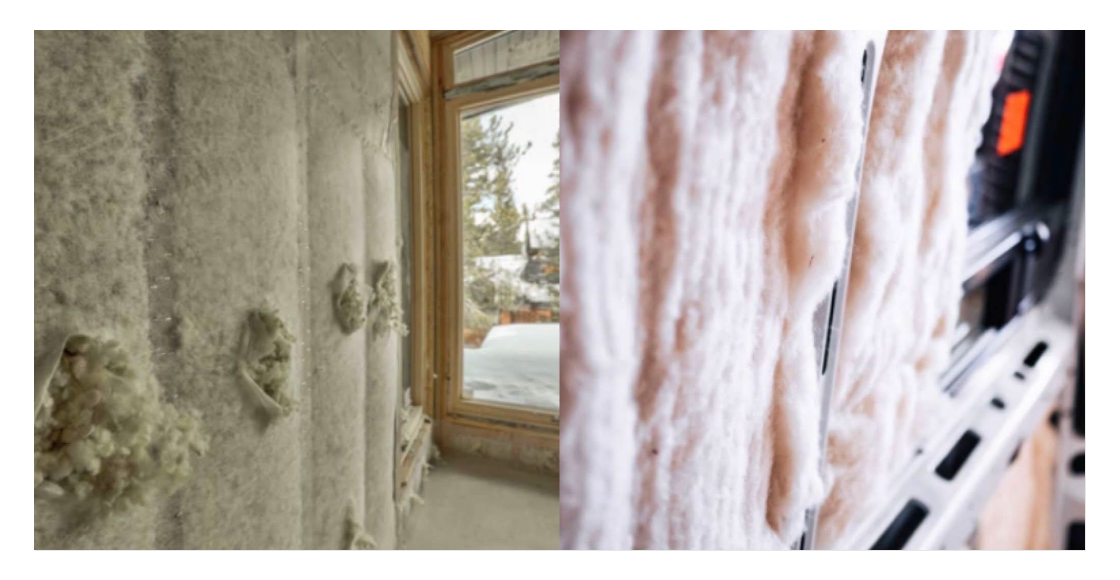
Figure 3-2: sheep wool insulation from Havelock Wool, for homes on the left and vans on the right

Havelock Wool<sup>17</sup>, based in Nevada, produces insulation materials for homes and campervans out of sheep wool from New Zealand. The company is branding their products on their abilities for moisture management, sound and heat insulation, absorption of VOCs and biodegradability. These properties are attributed to the inherent properties of wool as a natural product, and it is claimed that no man-made insulation material performance as well as Havelock Wool. The company has explained that a large and growing cross-section exists that is interested in moving away from synthetic materials, and that Havelock Wool offers an alternative.