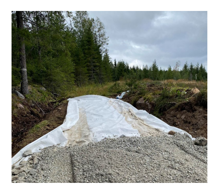
Figure 3-1: Geotex 2000 landscape fabric made of polypropylene here used for erosion control when constructing new roads in Finnskogen, Norway.

Wool is used in the garden and for cultivation as a material in several different products. The most important qualities of the material for these products are biodegradability, temperature control and ability to absorb moisture. For many of these products, contamination in the form of faecal matter and other organic material will not be a problem. The products consist of felt covers for plants or raw wool for mulching. Covering plants is used as a method for weed- and temperature control as well as creating a barrier between the plants and potential soil-borne diseases. Non-wool garden covers, such as garden fleece, are usually synthetic and made from the polymer polypropylene. These synthetic materials will contribute to microplastic pollution if not removed but left to decompose. Furthermore, their aesthetic nature can be said to not blend well with that of nature.