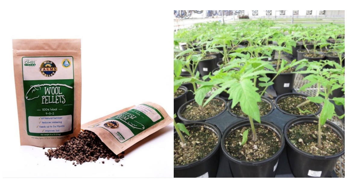
Figure 3-1: NutriWool Pellets from Wild Valley Farms made of 100% raw wool

Wild Valley Farms has developed a product that has received attention among US farmers. They started adding waste wool from their sheep ranch to the soil before leaving for vacation, finding that they were able to leave their plants without watering for a longer time. They saw the potential in this discovery and together with Utah State University they developed NutriWool Pellets<sup>14</sup>, a fertilizer and water solution made of raw wool (see Figure 3-1). On their website, they claim that since their pellets absorb and hold water, they can reduce the need for watering while also protecting plants from over-watering. In addition, they increase porosity in the soil and add nutrients reducing the need for other additives. It is stated that the pellets are a 9-0-2 grade fertilizer meaning that they contain 9 per cent nitrogen, 0 per cent phosphorus and 2 per cent potassium, the three most important nutrients for plants in terms of quantity.