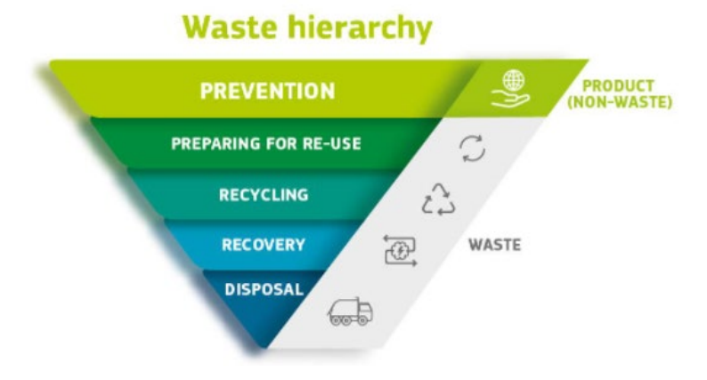
Figure 1-2: The waste management hierarchy (European Commission, n.d.)

The EU Waste Framework Directive uses this model and states that preventing waste is the preferred option, while sending waste to landfills should only be a last resort. The model is concerned with material flows and on the "prevention level", everything is considered a product and thereby non-waste. The directive further distinguishes between waste and by-products, and supporting production based on by-products could be a way to decrease or even prevent waste production. Today, this is not part of any policy in the EU (or Norway) and the poor utilization rate of by-products such as wool is not attempted solved.