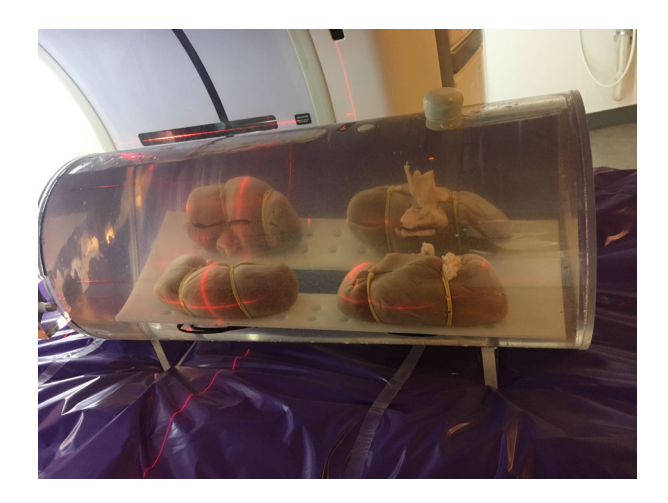
Figure 1. Water-filled phantom with four porcine kidneys attached to a plastic ledge. The mean circumference for an average 9 years old boy/girl: 63.6cm/62.6cm respectively while the phantom circumference is 63cm.

The 42 renal stones used in this study were borrowed from the Department of Urology, Lillebaelt Hospital, Vejle, Denmark. These stones had been previously removed from 20 patients during surgery (10 female, nine male, one unknown; mean age 59 years (range 40–74). The chemical composition of the stones was determined using Fourier transform infrared spectroscopy which classified the stones as brushite (n = 6); calcium– phosphate/struvite (n = 1); calcium oxalate dihydrate (COD) (n = 5); calcium oxalate monohydrate (COM)