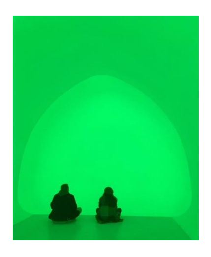
Figure 2. "Ganzfeld", 2019