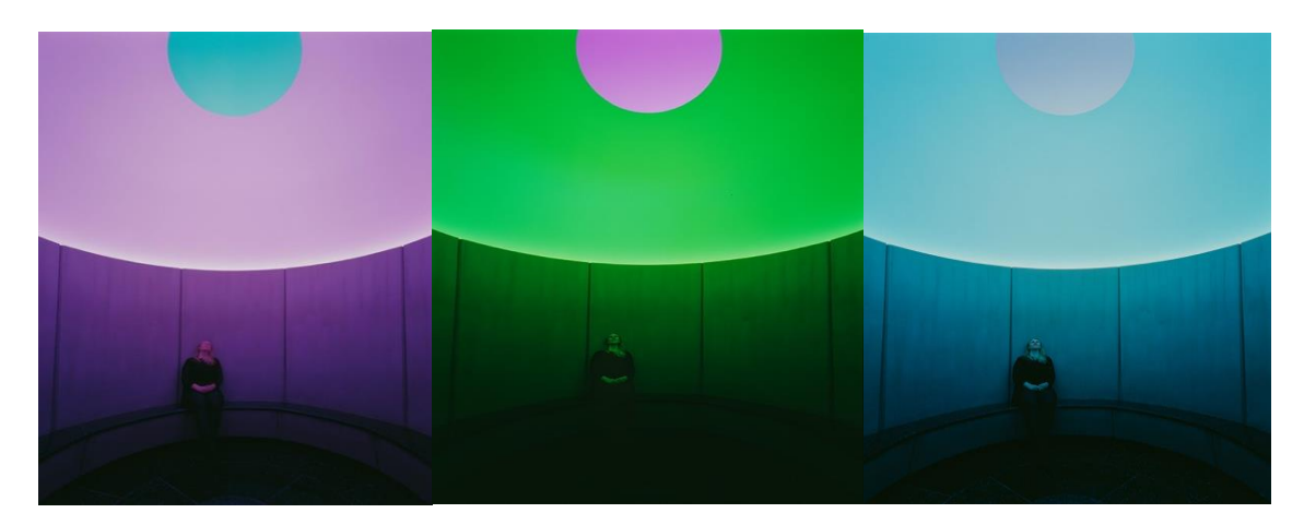
Figure 3. "Skyspace; The Colour Beneath, Oslo" 2013

Sitting in a circular space, while looking directly at the sky through an opening in the ceiling with the lights changing colours in the space, makes the perception different [4]. The experience is about having different perceptions of the sky distance from your place while being indoor [2]. The sky without any objects such as clouds or stars looks transparent, but it also illustrates the homogeneous visual field as Ganzfeld. This perception makes the relationship between these two installations [1].