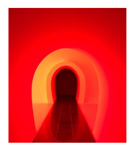
Figure 1. "Ganzfeld", 2019