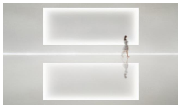
Figure 4. James Turrell Installation in Hyundai Capital Convention Hall

On the top of the south tower of Hyundai Capital's global headquarter in Seoul, the 6,250 square-foot assembly space was completed in the summer of 2016 by the Gensler design group. This new hall was aimed to deface the lines between art and architecture by manipulating the user's perception of material, light, and space. The design was aimed to create a timeless space without boundaries [5]. This project was nominated for interior architecture by AIA awards in 2019 [7] and the best use of innovative lighting by Frame awards 2020 [5]. This project is designed to be flexible for hosting a wide range of activities, including training sessions, company meetings, client presentations, guest lectures, and parties in addition to expressing the essence of Hyundai minimalist and progressive brand [5]. The interior consists of an artistic installation from James Turrell (Figure 4), a classic photography cyclorama, and a moulded acoustical plaster shell form by Gensler designers [7]. The design team used layers of innovative light design as indirect sources to illuminate glowing arches while adding a visual perception to space (Figure 5) [5]. They also used light and colour to make a contrast in the presentation room with black colour and LED light lines [5].