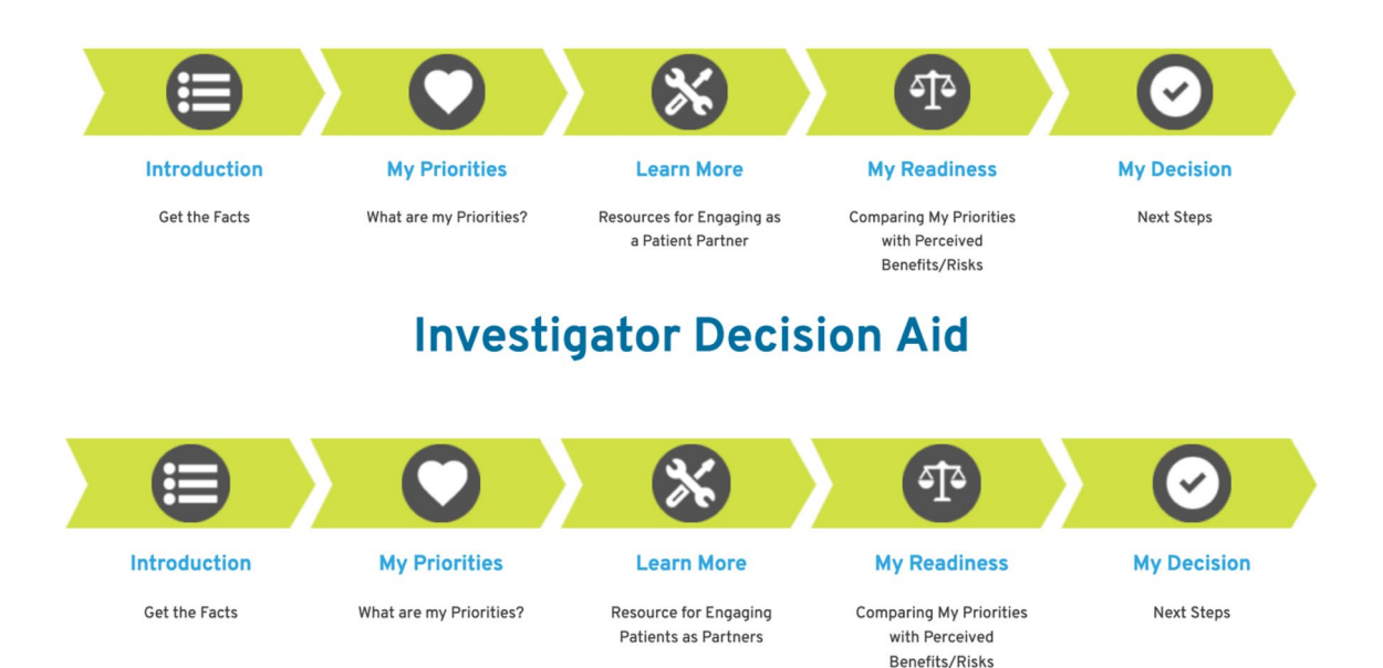
Fig. 3 Core functionalities of the patient and investigator decision aids