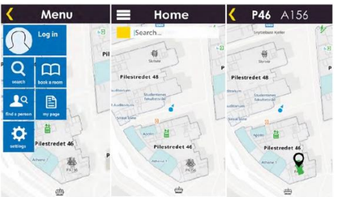
Figure 2. Mobile navigation app

The main functionality of the app was to help the users find their way on the campus. However, the feedback from the interviews and scenario-based user testing indicated that the users wanted additional functionalities, such as booking a room and finding a person. The app was therefore designed so that upon opening the app, the main page displayed a map showing the user's location. This page contained a search bar and a menu icon. By default, the search bar allowed the users to enter the name of the place they wanted to find. Tapping on the menu allowed them to change to other options, such as 'find a person' and 'book a room'. Figure 2 below illustrates the menu page (left), the main page (middle) and the search result page (right).