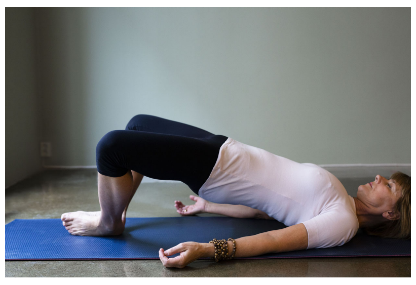
Figure 3. Exercise designed to fatigue the pelvic psoas muscles.