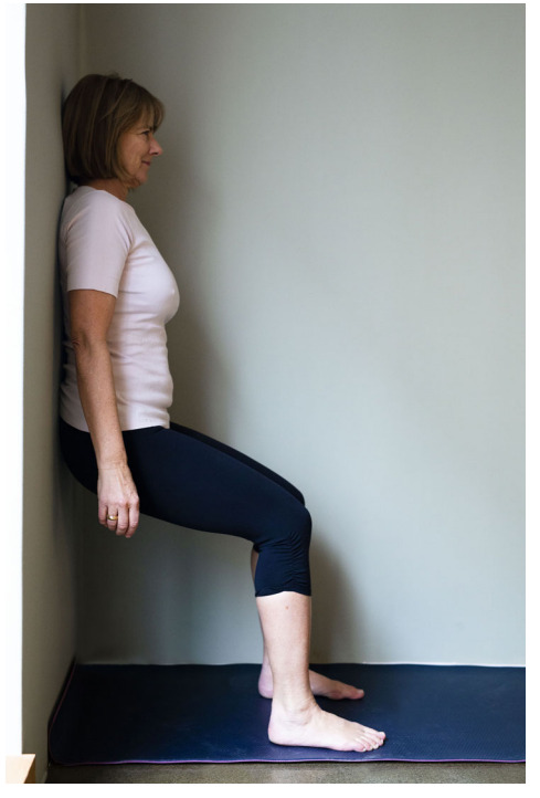
Figure 2. Exercise designed to fatigue the major muscle groups of the legs and pelvis.

Letting the body surrender control allowing the body to shake is the main part of TRE work and is happening during these sequences, especially when the pelvis is resting on the floor. The shaking then is the body's innate response to lower the tension level built up during the exercises (Figure 4).