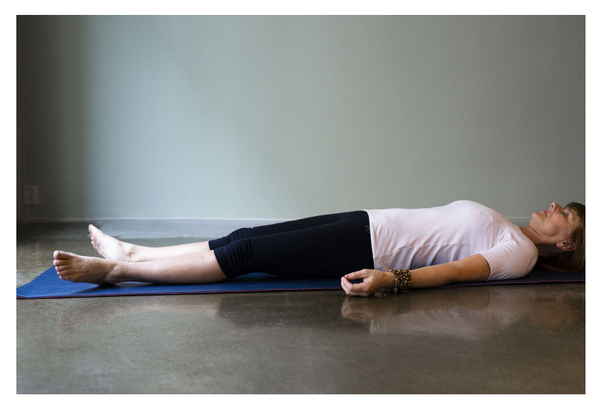
Figure 5. Open attention noticing changes and body sensations.

observing and supporting the students both physically through different types of touch and by creating a safe environment using the voice.