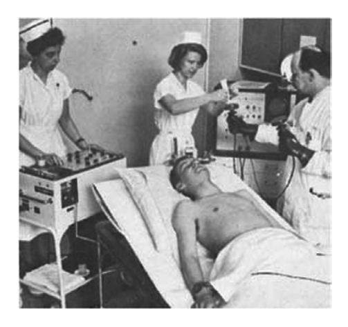
FIGURE 1 Headline: 'Developments in the treatment of cardiac patients'. Photo caption: The patient is anaesthetised, and the physician who is wearing large rubber gloves is holding the electrodes that are pressed against the patient's thorax. The background shows an electrocardiograph on the left and a defibrillator on the right. The nurse on the left is holding the electrode paste, and the nurse on the right is standing by to trigger the desired surge. Published in: Tidsskrift for Sygeplejersker, 1965.

The Danish journal Sygeplejersken [The Nurse] (originally entitled Tidsskrift for Sygepleje [Journal for Nursing], then from 1950 to 1972 Tidsskrift for Sygeplejersker [Journal for Nurses]) was founded in the year 1900 and is the publication of the Danish Nurses' Organisation. The Norwegian journal Sykepleien [Nursing] was founded in 1912 and is the publication of the Norwegian Nurses' Organisation. Both journals have been published sometimes weekly, sometimes monthly at various stages. Their readership in both countries consists mainly of registered nurses. Both periodicals performed two functions from the start: presenting scholarly knowledge and raising organisational issues related to the profession for debate. As the function of a large part of the visuals is to illustrate topics relevant to the nursing