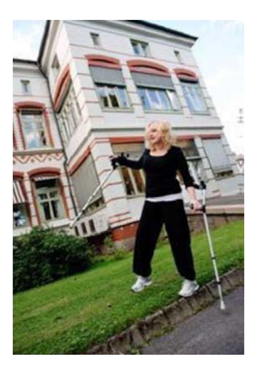
FIGURE 6 Headline: 'Out of bed. With medication and facilitation, she lives almost just like everyone else'. Photo caption: It's all about getting the body to function so I can work. Published in: Sykepleien, 2010.

Figure 6 represents a new trend in portraying the patient neither in hospital nor at home, but out of doors. Disease is constructed here as something that can be overcome by self-discipline, and the patient is constructed as motivated by the desire to work and live like other people, that is, like healthy people. It is emphasised that patients can 'tolerate' being physically active, something that can be achieved by 'reassessing mental barriers and motor constraints' (Hernæs, 2010, p. 35). It is notable that the emphasis on the importance of overcoming barriers could be said to characterise sick people as lacking in initiative. The norms coming up in the visual include the understanding that patients need to be kept active to be healthy, and that engaging in