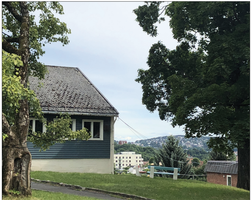
Figure 2. Ås, Bjørnebekk asylmottak and Oslo, Torshov asylmottak.