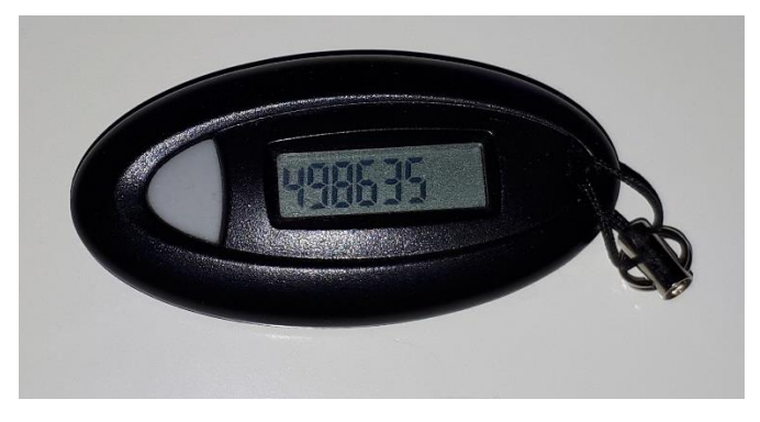
Fig. 1. bankID code generator

The code generator requires fewer actual keystrokes, yet the task of copying an arbitrary sequence of digits is cognitively and visually more demanding than recalling 8 to 16 digits from memory. Opinions vary about which of the two is the best. This study therefore set out to determine which of the two methods is the fastest to use, and what method users prefer.