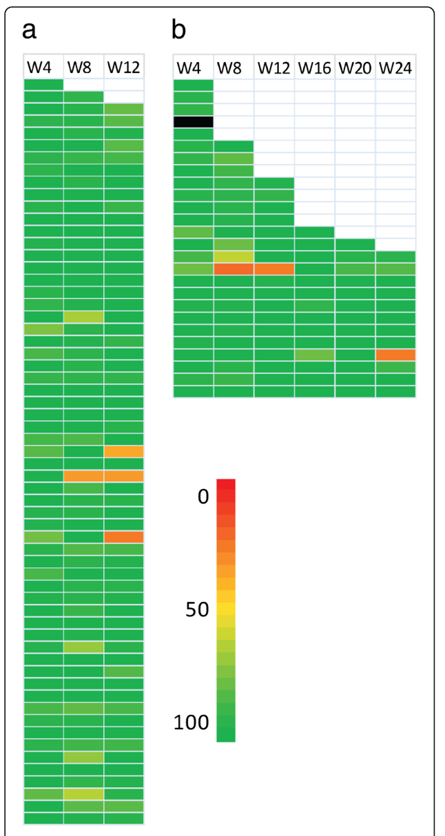
Fig. 3 Four-weekly RBV adherence among HCV genotype 2/3 participants on shortened (12 weeks; n=61; panel a ) and standard therapy (24 weeks; n=26; panel b ). Each row represents a study participant. Colours represent each participant's RBV adherence during each four-week period with dark green representing 100% adherence and red representing 0% adherence. White represents discontinuation before completion of the corresponding time-point while black represents missing data for both retuned pill counts and patient reported adherence before treatment discontinuation

The mean on-treatment PEG-IFN adherence was similar between those receiving 12 and 24 weeks of therapy (98.5% vs. 98.7%, P = 0.811). The proportion of participants missing at least one dose of PEG-IFN while on therapy was 3% in those receiving 12 weeks of therapy