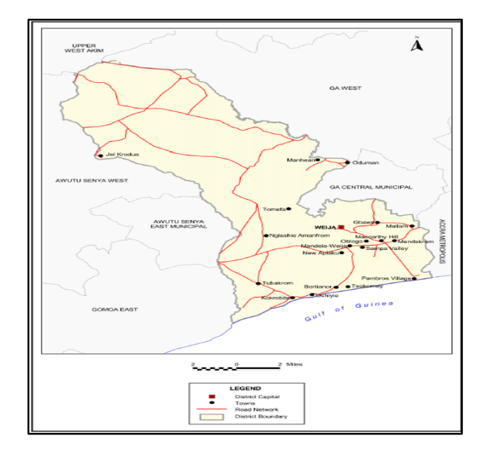
Figure 2 Map of Ga South Municipal assembly