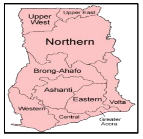
Figure 1: Regional Map of Ghana