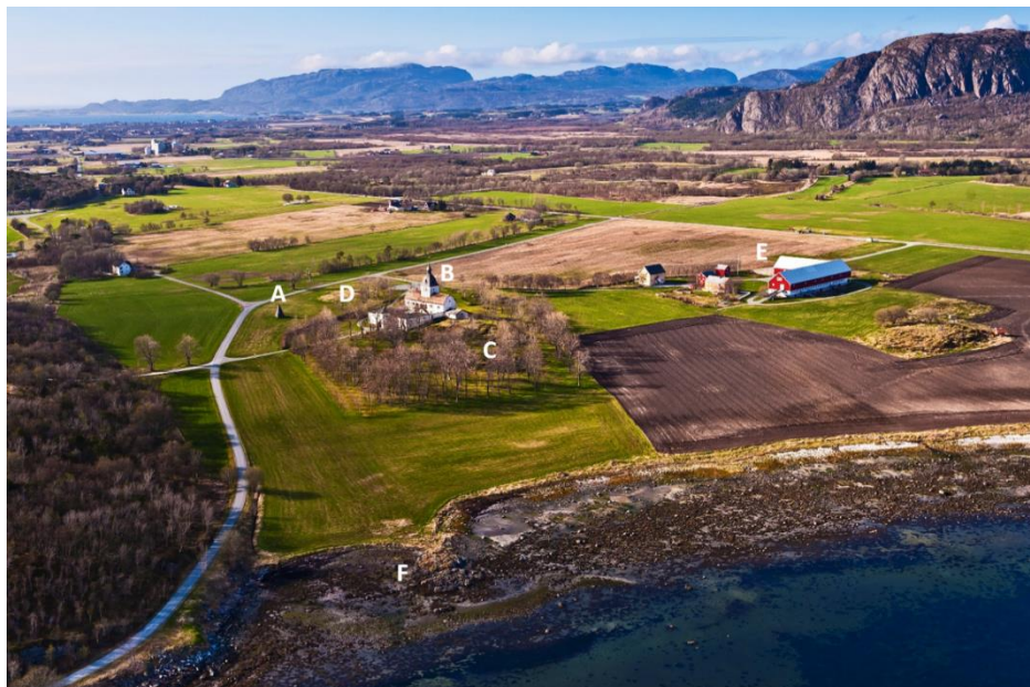
Figure 5: A bird's-eye view of the Austrått landscape taken from the southeast. Structures in the image are: A. the pyramid; B. Austråttborgen (Austrått manor house); C. East garden; D. site of West garden;