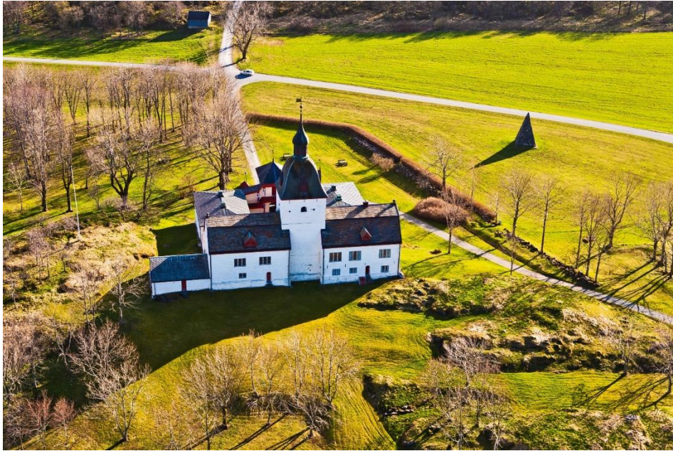
Figure 6: Austråttborgen (Austrått manor house) from the rear and the pyramid.

E. Austrått farm; F. site of Austrått harbour. Austråttlunden (hunting park) is to the left of the image and is not visible here.