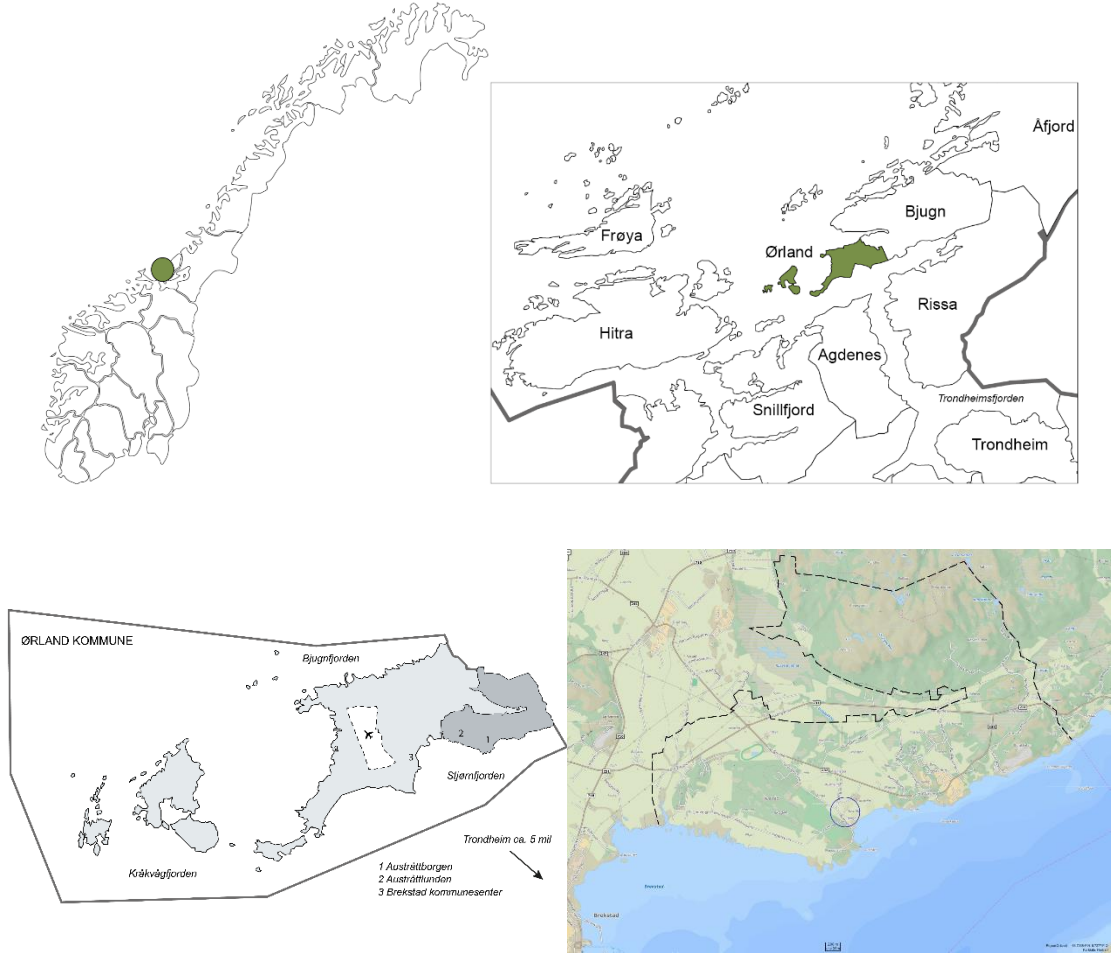
Figure 1: Location of Ørland (Fig.1a, 1b) and the coverage of the Austrått landscape (Fig.1c, 1d).

are protected under different frameworks and for different reasons. This creates difficulties when a single management plan is needed for the entirety of the Austrått landscape (see figures 1-2).