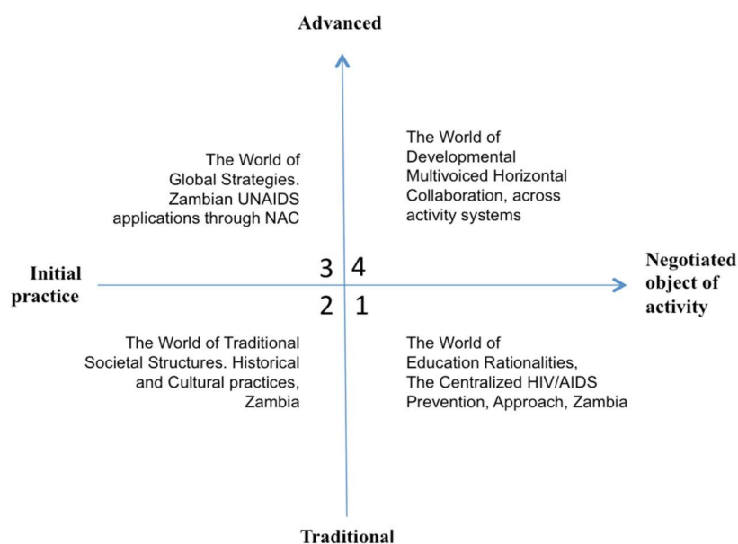
Figure 3. The world of education rationalities and the centralized HIV/AIDS prevention approach in Zambia.

Rapid changes through new technologies, disasters including climate change, or epidemics like HIV/AIDS and Ebola require knowledgeable and skilled professionals to address challenges throughout the world. These professionals have to build upon the existing knowledge and needs as experienced by those acting upon new requirements, as illustrated by the vertical axis moving from traditional practices to a more advanced or new objective (see Figure 3). The concept of professional education must also reflect these new requirements.