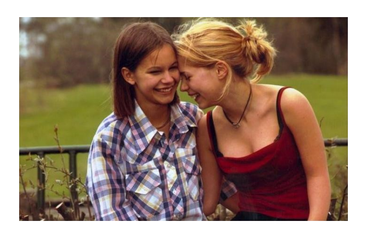
Figure 2: Photo from the movie "Fucking Åmål"

It is hard to illustrate bisexuality in pictures, and I have not found good examples of that, and no good photos connected to transgendered persons either. The LGBT related illustrations that do not show two persons of the same sex are most often rainbow flags (eight instances) or other kinds of logos. There are also other illustrations: one photo of concentration camp prisoners with pink triangles, some pictures of historical persons (Sapho, Oscar Wilde, Erling Lae, Gro Hammerseng and Katja Nyberg, Siri Sunde, Kim Friele and Wenche Lowzow) and a photo where someone has written "Bjørn is gay!" in the road.