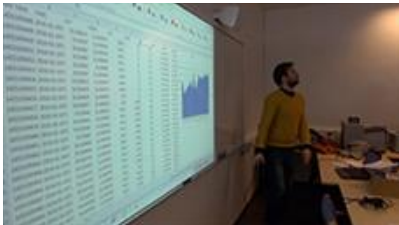
Figure 4. Performing calculations on vital health signs data

During their lessons in the mathematics class, the pupils were instructed to use a spreadsheet to analyse the data they produced in their PE class. The teacher spent considerable time explaining the user interface and the different statistic functions of the spreadsheet application. In particular, the pupils were introduced to the relationship between cells, rows, and columns, and were taught how cell addressing works, including how to calculate averages. Other more advanced statistical functions were not used in the classes we observed. It is important to add that the pupils had limited previous experience in the use of spreadsheets prior to their introductory lesson just a few days earlier.