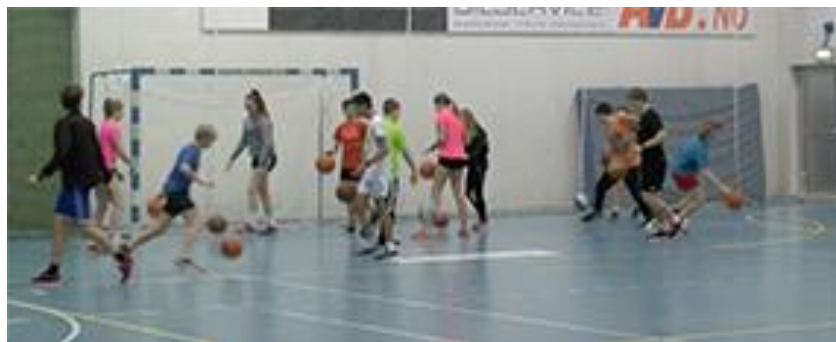
Figure 3. Physical training

In the PE lessons, the pupils were instructed to initiate the activity tracker on their smartwatches, after which the teacher proceeded with his lesson as usual, giving them different physical tasks and exercises to complete. The assigned tasks in PE were designed to ensure there was a mix of moderate and high-intensity activities. Between the various activities, the pupils sat on the floor and were given instructions. All the PE lessons were indoors, and thus, the activities did not generate data on changes in altitude.