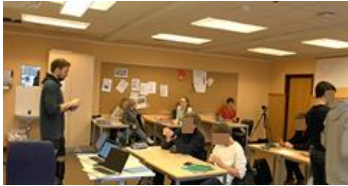
Figure 2. Introducing the Fitbit to the pupils

When the pupils first received the watches, they were excited and highly motivated to use them, which is a usual novelty effect reaction. The teacher asked the pupils to move around and generate data, which led to a change from the typical classroom activity (sitting) to physical activities, such as jumping, to increase their heart rates. To help the pupils become familiar with their watches, the teacher initiated several activities, such as ‘walk for 10 minutes during break’, ‘walk 200 metres’, and ‘walk a geometrical figure’. After returning to the classroom, the teacher conducted whole class math discussions on measurements, especially on the 200 m walk, focusing on how the pupils solved their given challenges.