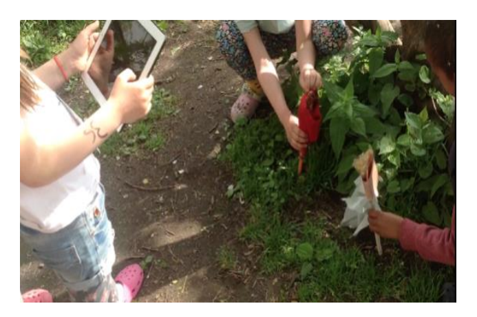
Figure 1. Pupils discovering video recording possibilities with the iPad.

On the second day, some of the pupils discovered several features of the app that could be used to enrich the fairy tale, creating a more advanced multimodal text. For example, in the school yard, one of the pupils discovered the possibility of embedding a video recording into their book (see Figure 1).