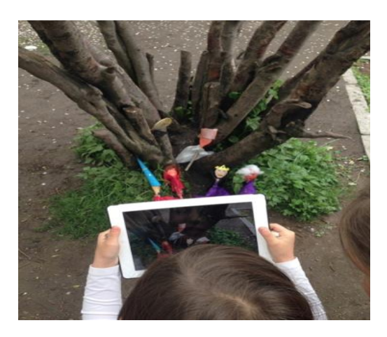
Figure 2. Pupils used the surroundings to help create their story, incorporating this into a multimodal fairy tale.

The pupils were encouraged to use the iPads outside the classroom; thus, the pupils' workspace no longer solely encompassed the classroom but was expanded to the entire school premise. The pupils took the iPad, their story and their characters outside to the school yard. They used the iPad to take photos of their wooden-spoon characters, which were placed in the grass, leaning against a tree or placed on a rock, thereby making scenes that were used to shape the plot and enrich the story (Figure 2).