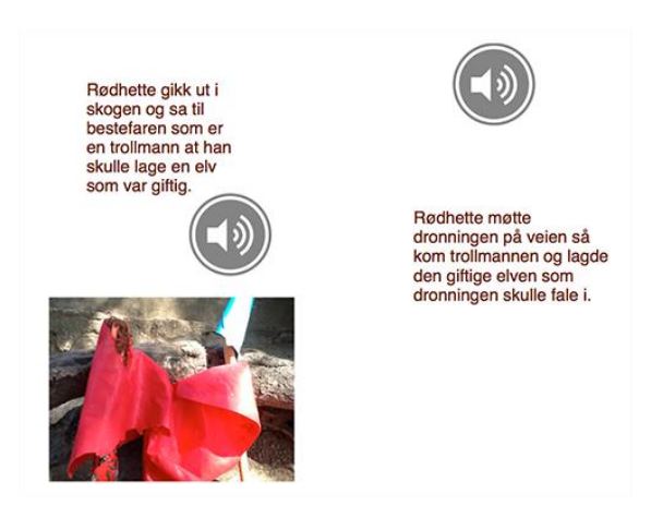
Figure 5. Screenshot of a result in Book Creator.

For example, pupils made comments such as 'I read through the whole book when we were done looking for spelling mistakes'. In this context, the iPad established a learning situation where it was more important for the pupils not to have grammar and spelling mistakes. They were obviously proud of their products. The group process, in combination with the feedback from the voice recordings, supported the pupils' discovery and awareness of spelling and grammar. Also, in the final phase of the fairy tale project, the iPad acted as a regulator for interactions within the group while also providing support for pupils' discovery of spelling and grammatical errors.