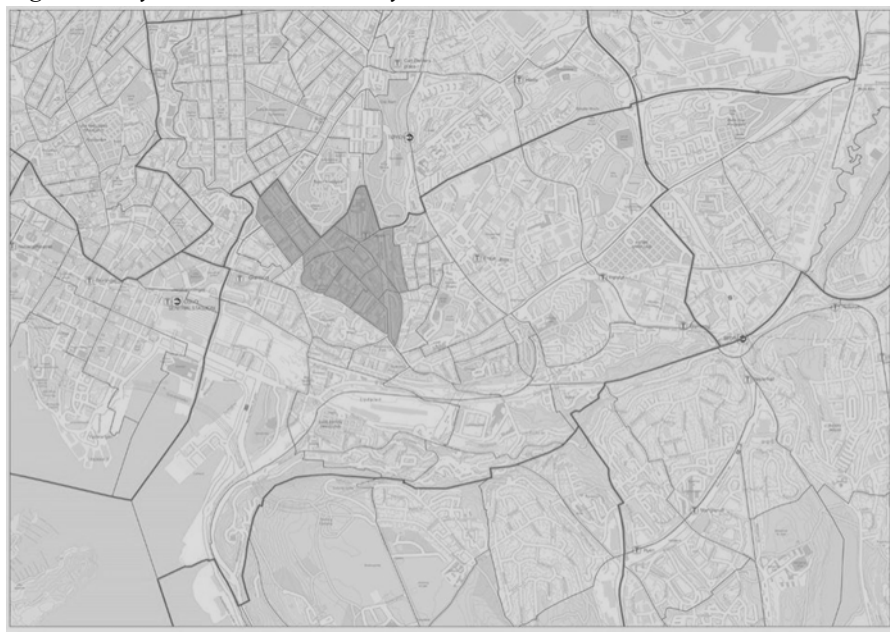
Figure 1: Tøyen's location in the city