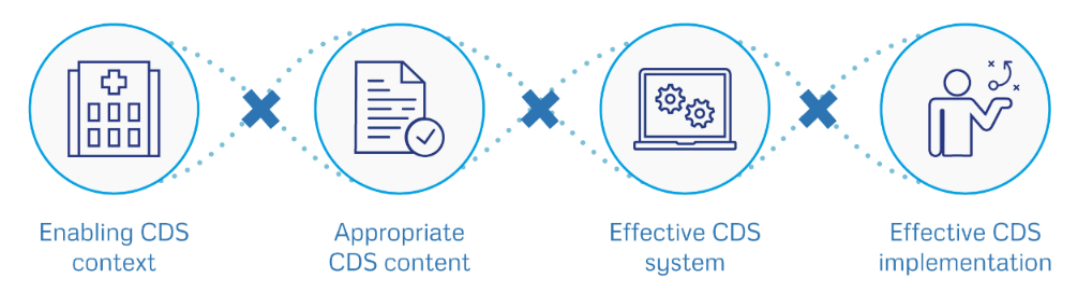
Figure 1. The GUideline Implementation with DEcision Support (GUIDES) checklist contains 16 factors covered by 4 domains that potentially impact on the success of computerized decision support (CDS) to implement recommendations. The CDS context domain focuses on the circumstances in which CDS can be potentially successful; the CDS content domain focuses on the factors shaping the success of the advice produced by the CDS system; the CDS system domain focuses on the features belonging to the CDS tool; and the CDS implementation domain refers to the factors affecting the CDS integration in practice settings.

We aimed to recruit 3 GPs and 3 knee osteoarthritis patients per focus group. We used convenience sampling based on our personal networks and recommendations from colleagues. We included patients from different age groups, with different degrees of osteoarthritis and patients having osteoarthritis as a single condition together with patients having comorbidities. We ensured that patients and GPs in the same group did not have a personal doctor-patient relation. We also ensured that there were at least as many patients as GPs to increase patients' confidence when expressing views and experiences.