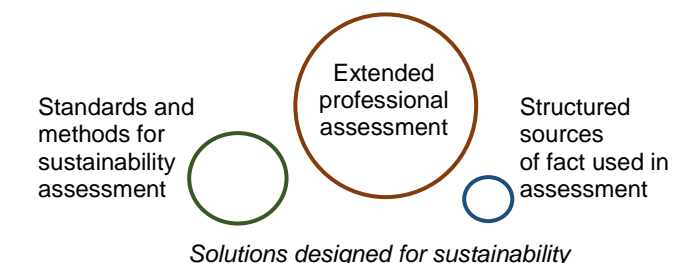
Figure 2. Lack of integrated perspectives in assessment of sustainability

This study did no go into detail about how sustainability was in educated in practice. However, if sustainability is incorporated in a higher degree than this study indicate, this this teaching is not supported by textbooks or standards. Another aspect is that professional assessment of sustainability of designed solutions is demanding, and will often require multidisciplinary competence. IDDS was introduces as framework in figure 1. Figure 2 is a visualization of the general impression of the results. They indicate a lack of integrated perspectives in use of sustainability as a defined assessment criteria of designed solutions.