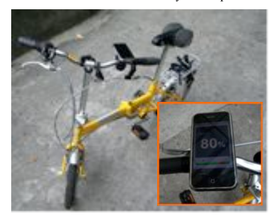
Figure 2. The mobile is placed at bike stem; it senses acceleration data when bicycling, and infers terrain and stamina cost.

We invited ten bikers to engage with the evaluation of the system for a short route including several terrain patterns (blacktop, grass, uphill and downhill). Most of the participants have more than eight years of bicycling experience and would ride a bicycle several times per month. A few bikers had used cyclocomputer or GPS