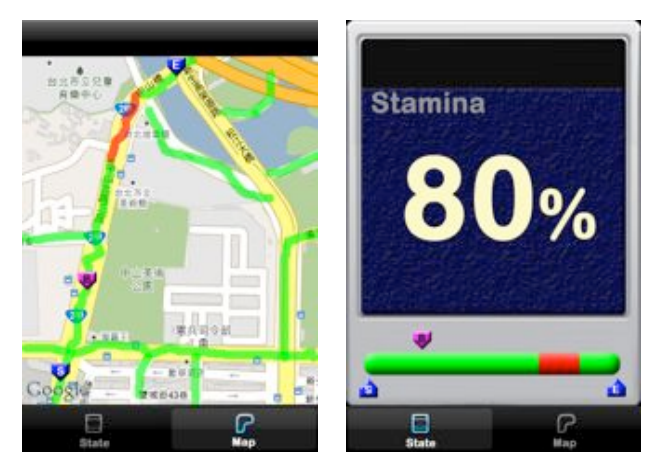
Figure 3. System prototype: stamina map and user state visualizations.

navigation. After a field evaluation, we conducted interviews to evaluate whether the stamina information feedback supports bikers to detect usability issues and acquire general critiques and suggestions.