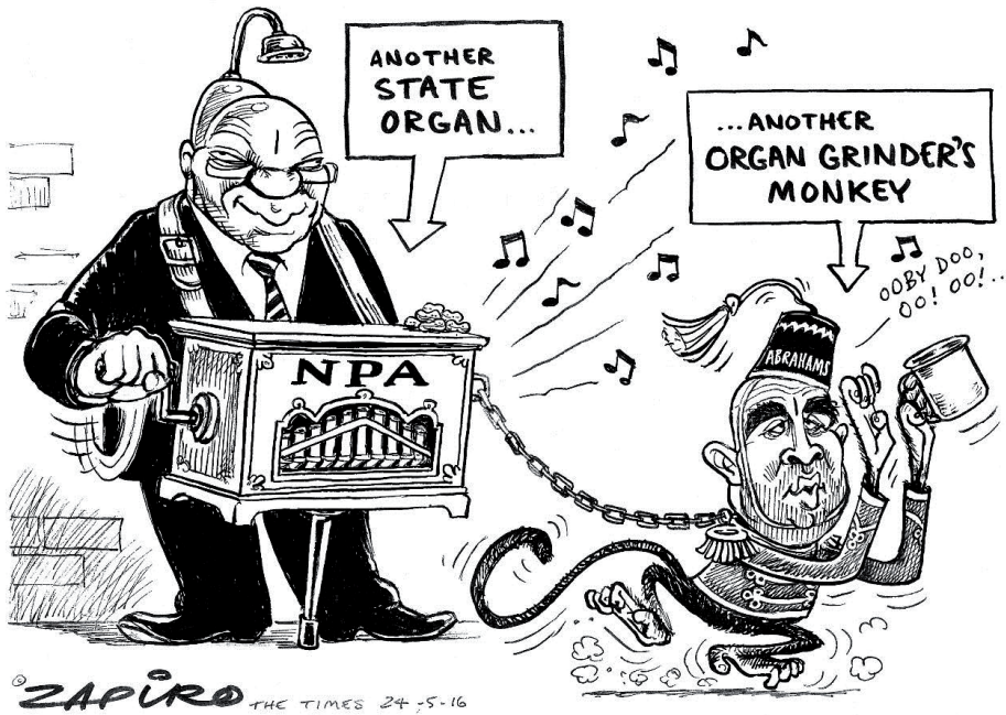
Figure 3.2. Another State Organ © Zapiro. Originally published in The Times , May 24, 2016. Reprinted with permission; no reuse without rightsholder permission.

current cultural context, or, more broadly, given the long tradition of denigrating black people by drawing them as monkeys.