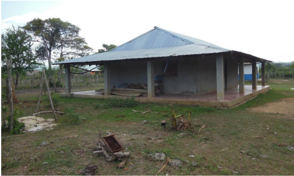
Picture 3. Vacant farm in El Carmen de Bolívar. It was restituted to the original owner, but he did not want to return there and take up farming again.

The advantages in the offer of Free Housing are reflected in the number of IDPs who have signed up for the program. It is estimated that up to 900,000 households are on the waiting lists for Free Housing across the country (MinVivienda, 2014b), compared with only around 73,000 claims for Land Restitution filed by June 2015 (Valencia, 2015). To date, some 100,000 households have benefited from the housing program, whereas only 1,368 restitution rulings have been passed for around 4,000 households (Valencia, 2015)— well below expectations and original estimates of the URT, as the plan was to settle 360,000 cases by 2021 (Sabogal Urrego, 2013; Semana, 2015a). 12 Our interviews and observations indicate that the number of beneficiaries of Land Restitution who have returned and now live on their land is relatively low, although the exact figures are not known.