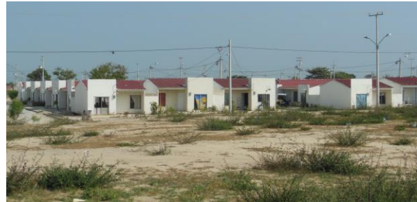
Picture 2. Nueva Esperanza housing project

All ten households report that at least one member receives regular income through employment or pension. Those who were employed had usually kept the same occupation they had before moving into the Free Housing project. Most were self-employed in formal or informal businesses, such as food vending and workshops. They operated either from their previous dwellings in the city, or (illegally) from the new houses or apartments in their Free Housing projects.