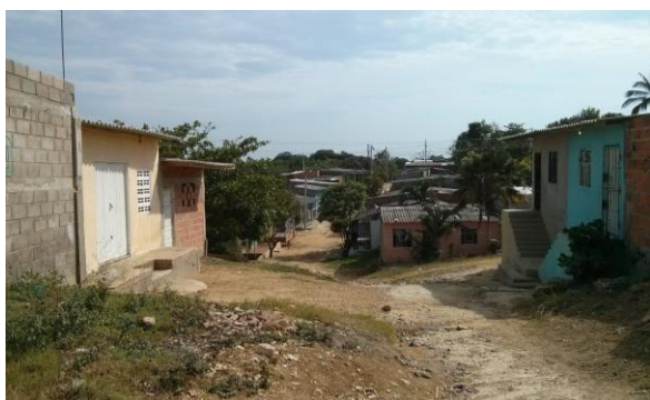
Picture 4. Siete de Abril is one of many informal settlements in Barranquilla inhabited largely by IDPs.

Serious complaints relate to the poor location (often outside of the built area of the city), overcrowding, use of cheap and prefabricated materials, lack of quality public spaces and commercial uses, as well as inadequate provision of health centers and police stations (Correra et al., 2014).