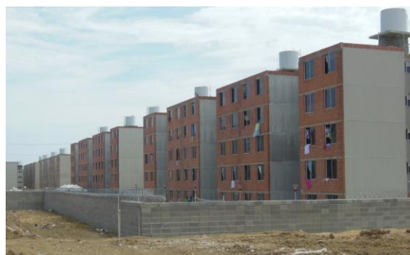
Picture 5. Las Gardenias Free Housing project in Barranquilla.

Insecurity might become a growing problem in the new Free Housing projects in the future, as an increasing number of crime, activity of local street gangs, acts of vandalism, stealing and consumption of drugs in common spaces are reported (El Heraldo, 2015). Lack of ownership and insufficient funds for housing improvement lead to a rapid deterioration of private and common areas, highly evident during our field visits. The local media have also reported how many of the projects might quickly be turning into ghettos and isolated pockets of poverty (Correra et al., 2014; El Heraldo, 2015; Semana, 2015b).