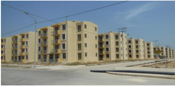
Picture 1. Villas de San Pablo housing project