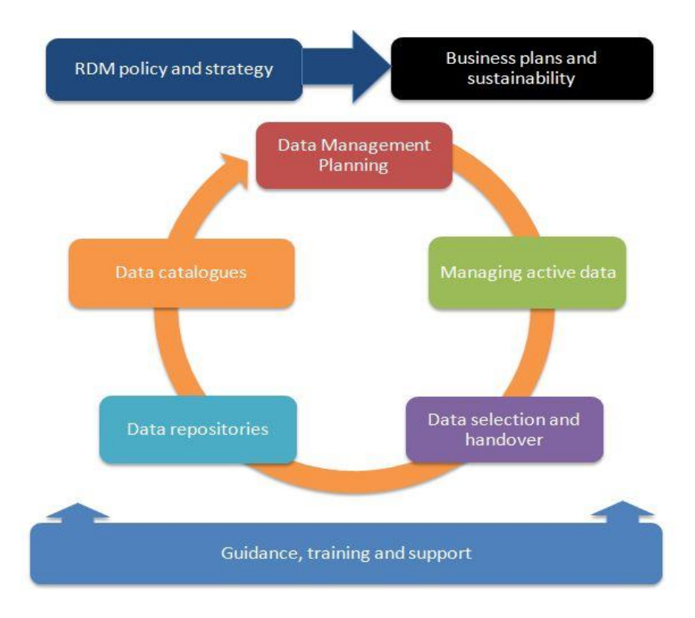
Figure.2 Components of RDM support services by DCC

Figure 1 shows a component of RDM support services developed initially by the Digital Curation Centre. It describes the various "infrastructures" and "services" that universities require to develop to support research data management (Jones et.al 2013). They further broadly grouped the structures into three categories: