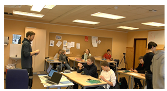
Figure 3: Introduction to the pupils

In preparing for data collection, the school's headmaster put us in contact with a teacher who had the same class for both mathematics and physical training. He rescheduled his thematic plan in mathematics so that issues such as reading tables, calculating averages, making and understanding charts and diagrams and learning how to use computer spreadsheets (Microsoft Excel) fit into our time frame.