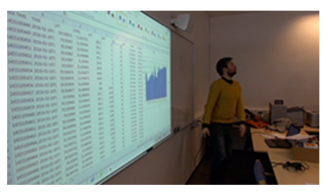
Figure 6: Performing calculations on bodily data

A good deal of the teacher's time in class was spent explaining the user interface and the functions of the spreadsheet application. The pupils were introduced to the relationship between cells and columns and were taught how cell addressing works. Following this introduction, the pupils were instructed how to calculate an average of the values of a column. The column representing the user's heart rate was chosen for this particular exercise. First, the pupils calculated their average heart rate during their previous physical training session. Then, they were instructed to create a diagram using data from the column representing their heart rate and the column representing time. Other calculations and diagram compositions were also attempted; for example, a plotted diagram with data from the columns representing latitude and longitude was created.