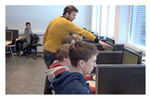
Figure 5: Performing calculations on bodily data