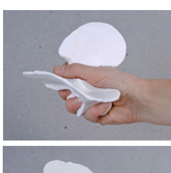
Figure 1 illustrates the connection between hand and object while making a Hand-Sketch. Here, the clay form is finished and stiff. The porcelain clay is dry, but the form feels smooth because of movements in the form. The photos show how different positions of the hand give various visual impressions, described as 'dynamically outward' in many directions, 'toward my body' and 'diagonally outward'. My sensed experiences are both visual and haptic. Not everybody has or realistically can have the particular experience of the moving, plastic clay, but anyone can relate physically to the grip.

Hand-Sketches are forms made intuitively. When making Hand-Sketches, the grip enters the clay as an imprint, and the clay simultaneously presses outward to fill all the negative space of the grip; a double directed action begins. Besides action, the concept of the grip implies both the form and structure of the hand and the hand's movement to shape the grip. The grip becomes the core-point when the hand is shaped into a grip in the clay. The grip already is charged with the force of being active, and the charge then is released with the plastic clay. I continue the shaping process by modelling some parts of the clay form that have been pressed outward, between the fingers. as negative forms of the grip. The clay forms are pressed, stretched and pinched. Sometimes, new clay is added to extend the form. The plastic clay engages my body; it gives me a feeling of being present within the form process. The Hand-Sketches spatially activate the way the form spreads outward in various directions. During the form process, I experience the different orientations of the form and the interaction with myself as form and movement.