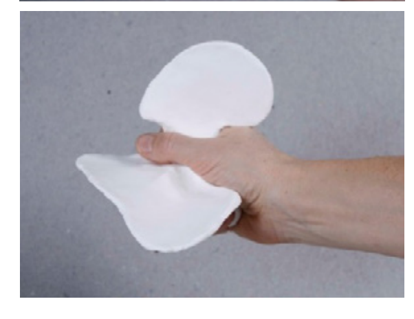
Figure 1 / Hand-Sketch, illustrating how the grip is used to explore interaction between form and body from different positions, 2012