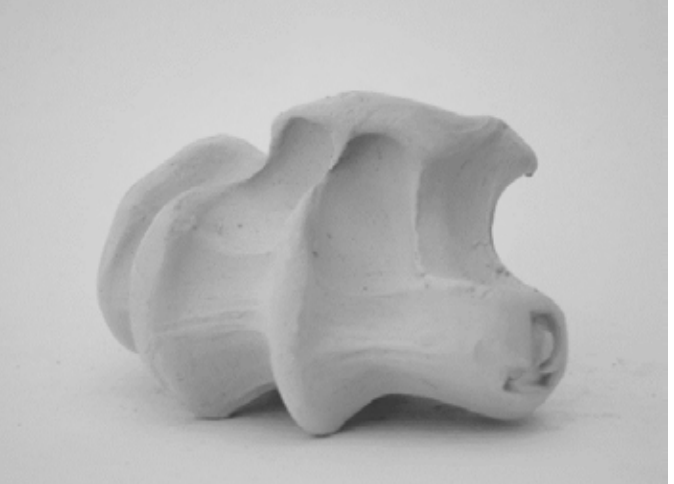
Figure 2 / Photos of Handforms: from the form process and the finished object.