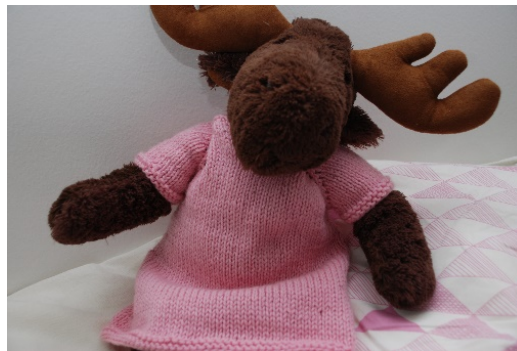
Figure 3. 'Elgar'

I offer a personal example of how to tell a story through the product, so the object keeps the interest of the user and gets them to care about it.