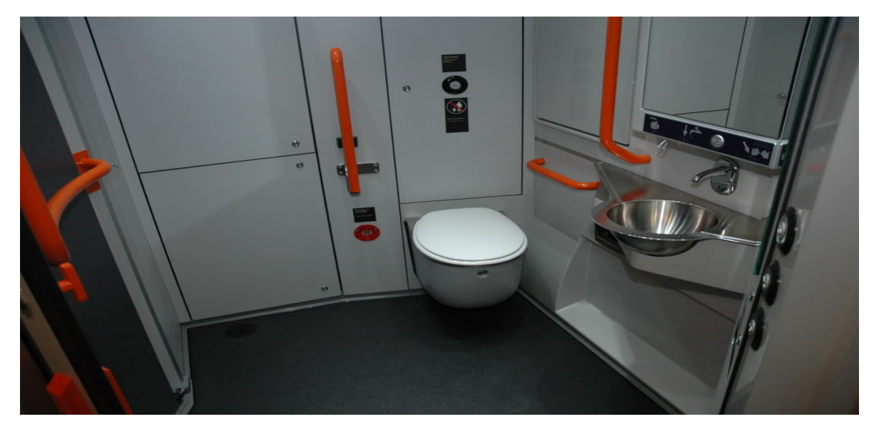
Figure 3. Taken on the train between Lillestrøm and Oslo