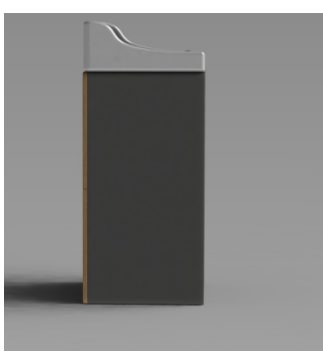
Figure 4. Sketch of example sink