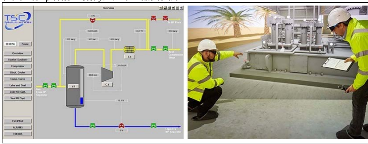
Figure 1: Process simulator by TSC Simulation is connected to the virtual reality environment I3TE by EON reality.

The literature search included companies that provide 3D/VR simulators for the chemical process industry. Other industries were outside of the scope of the search. The literature study is mainly based on the product datasheets available on the companies' websites.