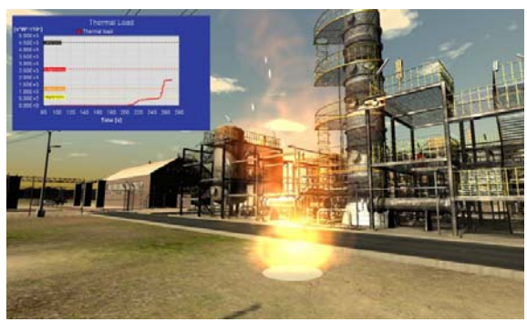
Figure 3: A simulation of an accident where AVR is used to impose additional information (graph on left top corner) [2].