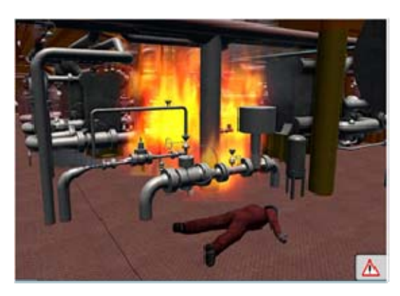
Figure 2: Emergency situation, Visualization of fire in COMOS Walkinside simulator [34].

performance. Generally, the assessment of performance is made by an expert assessor, which can easily be biased by his/her experience and knowledge. Therefore, objective performance measures ensure more robust, consistent, and unbiased assessments of performance.