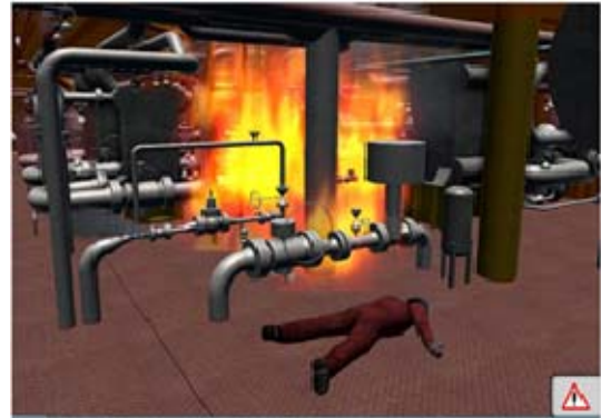
Figure 2: Emergency situation, Visualization of fire in COMOS Walkinside simulator [34].

performance. Generally, the assessment of performance is made by an expert assessor, which can easily be biased by his/her experience and knowledge. Therefore, objective performance measures ensure more robust, consistent, and unbiased assessments of performance.