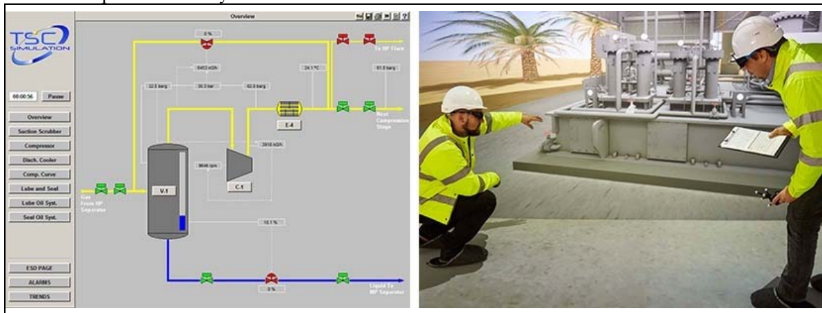
Figure 1: Process simulator by TSC Simulation is connected to the virtual reality environment I3TE by EON reality.

The literature search included companies that provide 3D/VR simulators for the chemical process industry. Other industries were outside of the scope of the search. The literature study is mainly based on the product datasheets available on the companies' websites.