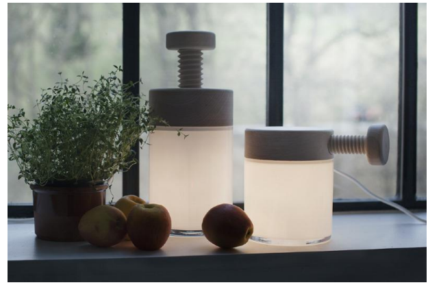
Figure 1 ABC: A: Living Forest. B: Woodwork bench C: The lamp Turn, by student Caroline Olsson

The student was fascinated by old woodwork techniques that she thought were connected to cultural heritage and noble, handicraft traditions: The lamp was inspired by the old workbench (Figure 1B) often used in wood workshops in Norway.