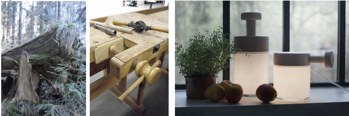
Figure 1 ABC: A: Living Forest. B: Woodwork bench C: The lamp Turn, by student Caroline Olsson

The reflections are documented from the student's master projects, highlighting some relevant categories: