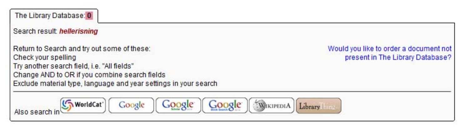
Figure 3: Instructions from Bibsys Ask when no results are returned, reproduced with permission

The participants were given ten predefined search tasks in Norwegian (see Table 1). Such tasks were used to allow for a direct comparison of search strategies and query formulations between the two groups. Imposed queries may be less motivating to solve than self-generated information needs (Gross, 1995). It was assumed that the participants were motivated to solve the tasks since they had volunteered for the study. Experimental task orders are often randomized to counterbalance learning effects. In this study, however, the search tasks were presented in a fixed order. The students had prior experience with the search system and it was assumed that the learning-effects would be minimal. The key design consideration was not to make the participants feel uncomfortable or lose courage during the session because of the varying difficulty levels of the tasks and poor self-esteem issues among many dyslexic students (Caroll and Iles, 2006). Consequently, the tasks were presented in increasing order of difficulty.