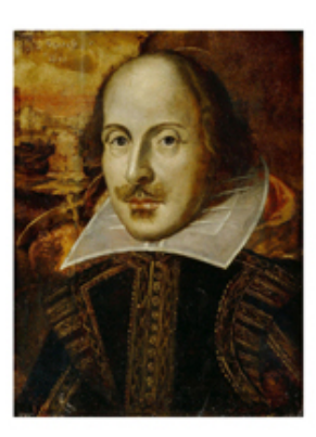
Figure 1: Example stimulus, task ten

At the start of the session the participants were asked about prior experiences with online library catalogues including Bibsys Ask. All ten tasks were completed in one session, and there was no dialogue between the participants and the experimenter besides responses to questions initiated by the participants. The students were allowed to use external online resources as supplementary aids if needed e.g. checking the spelling of a word. They were asked to comment on their search behaviour during debriefing where unusual behaviour had been observed.