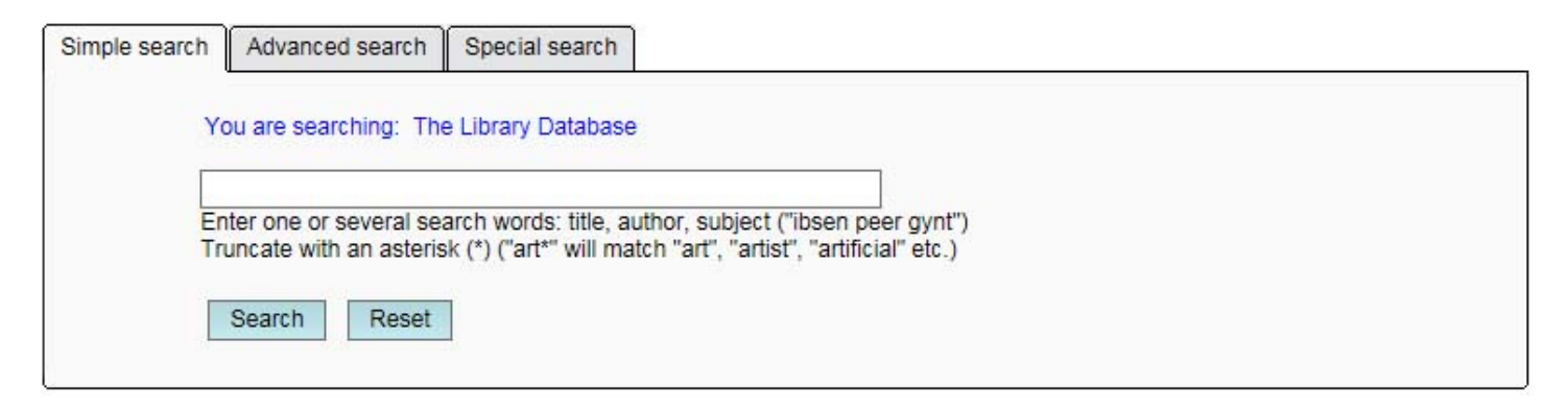
Figure 2: Simple search mode in Bibsys Ask (<a href="http://ask.bibsys.no/ask/action/smpsearch">http://ask.bibsys.no/ask/action/smpsearch</a>), reproduced with permission. The Norwegian interface was used in the study.

The experiments were run in the visual stimulus presentation software SMI Experiment Center version 3.2.11 using the background screen recorder. The stimulus was displayed on a 21' Dell LED flat screen with the resolution set to 1680 x 1050 pixels. Windows Internet Explorer version 9 was used for the search tasks, with all functions related to prior use such as browsing history and cookies disabled. All searches were conducted in the basic search mode in Bibsys Ask (Figure 2). Data were analysed using SMI BeGaze version 3.2 and the statistical analysis software IBM SPSS Statistics 22.