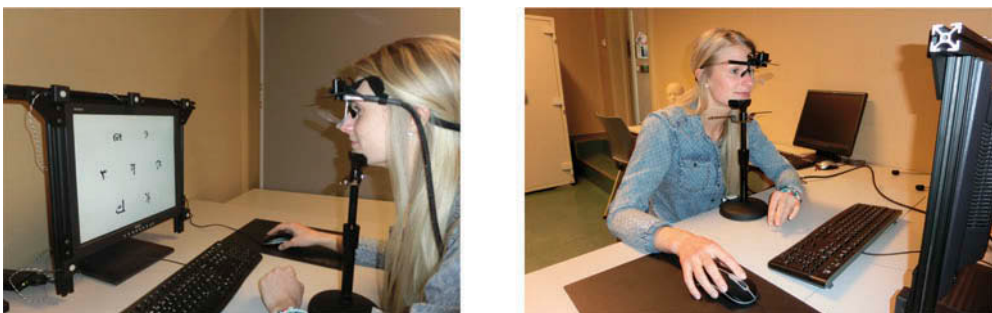
Figure 1. A participant situated in an experimental preparation. Wearing an eye-tracking glass, recording eye-movements of the left eye, the head is supported by and is rested on a non-intrusive chin cup system.

In a typical eye-tracking experiment (e.g., Dube et al., 1999), a participant is equipped with a head-mounted eye-tracking system that consists of two small video cameras, an infrared light, and a double-sided dichroic mirror (see Figure 1). The mirror guides light by selectively transmitting and reflecting different wavelengths, but it appears transparent to the participant. Additionally, the scene camera shows a significant portion of a participant’s field of view, and this is reflected on the outside of the mirror. The eye camera records eye-movements from the reflected image of the eye on the inside of the mirror via a corneal reflection system. Because the image reflection systems are head-mounted, Dube et al. noted that it is not necessary to immobilize a participant’s head. However, other research labs (e.g., Arntzen & Hansen, 2013) have found a non-intrusive chin cup (i.e., a head-support system that voluntarily immobilizes a participant’s head during recording—see Figure 1) useful. Finally, Dube and colleagues analyzed their video signals by using a computer that ran ISCAN Point-of-Regard Data Acquisition software. The output was “a real-time video field-of-view image with a superimposed cursor that indicated the participant’s point of gaze” (Dube et al., 1999, p. 9). The eye-tracking apparatus that was employed by Dube