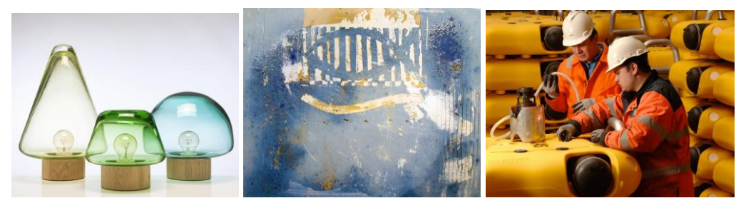
Figure 1 A, B, C. A. Green glass. B. Light blue porcelain. C. Signal yellow interface points